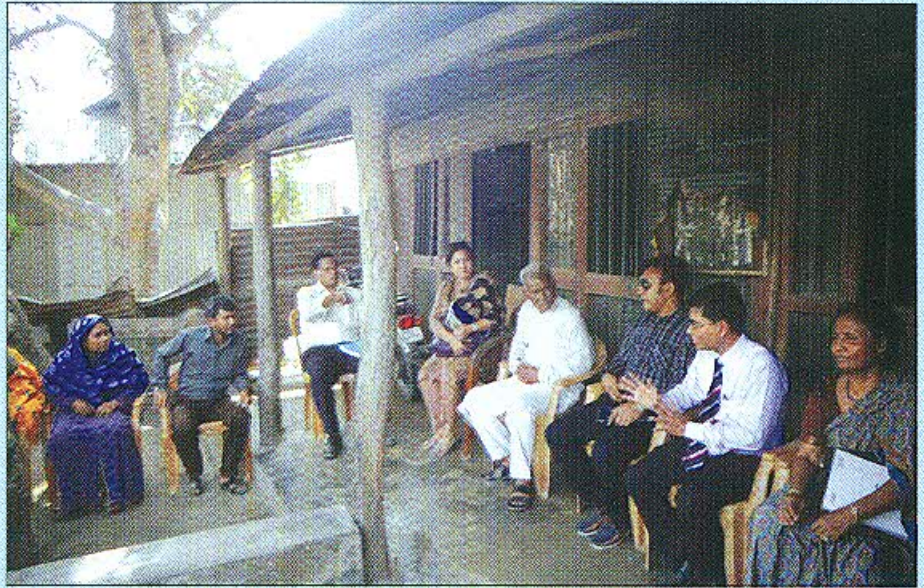
The ADB Mission is seen holding a discussion with officials of Union Parishad and members of business community relating to the possible piloting activities on Rural Water Supply and development of Pachpir Rural Market in Gaibandha district on 11 March, 2013.

At a meeting of the Executive Committee of the National Economic Council (ECNEC) held in Dhaka to-day, 05 March 2013, a project titled Northern Bangladesh Integrated Development Project (NOBIDEP) costing Tk.2705.94 crore has been approved. The project, funded by JICA loan of Tk. 2127.57 crore and GOB contribution of Tk. 578.37 crore, will be implemented by Local Government Engineering Department (LGED) under Local Government Division. The project area of NOBIDEP is constituted of 8 districts (Rangpur, Gaibandha, Lalmonirhat, Nilphamari, Dinajpur,