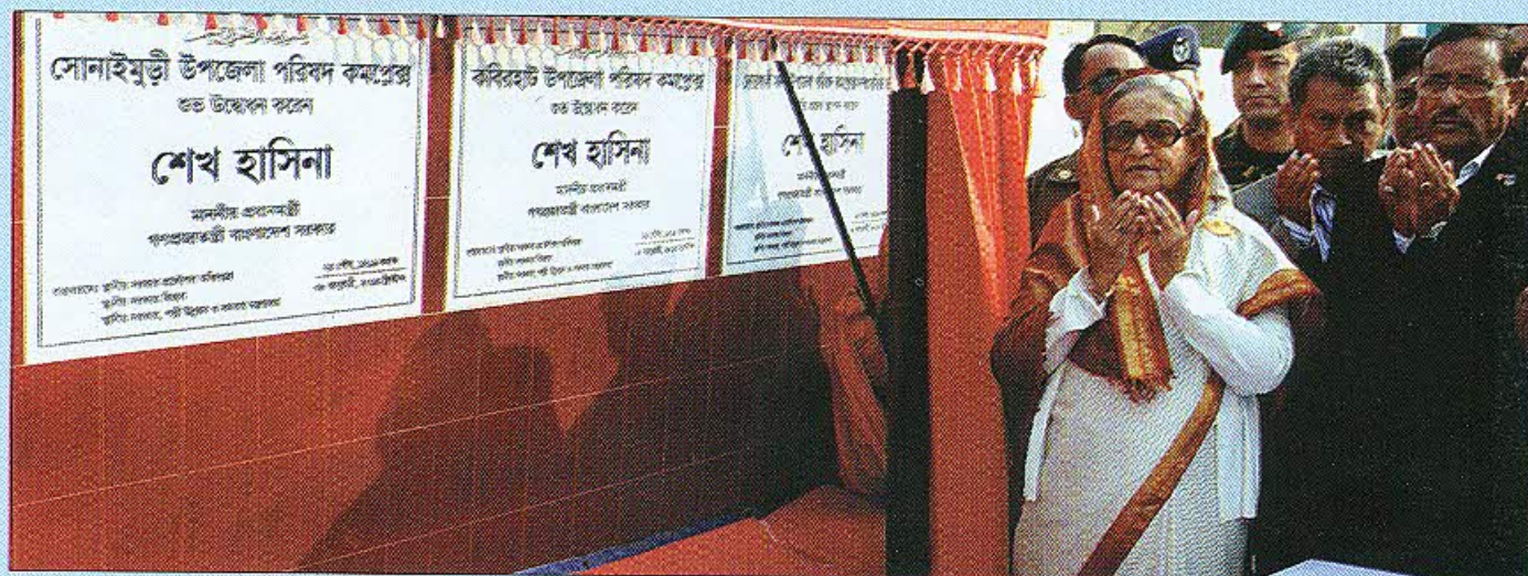
Prime Minister Sheikh Hasina inaugurated Kabirhat Upazila Parishad Complex, Sonaimuri Upazila Parishad Complex and laid the foundation stone of Noakhali Sadar Upazila Complex and Paurashava Bhavan on 8 January 2013.

The government wants to hand over sectors like education, health, law and order and infrastructure to local government bodies so that people do not need to go to the capital or divisional cities, she said. "We want to conduct all our activities through local government bodies", the Prime Minister said, reiterating her government's firm commitment to ensure people's empowerment.