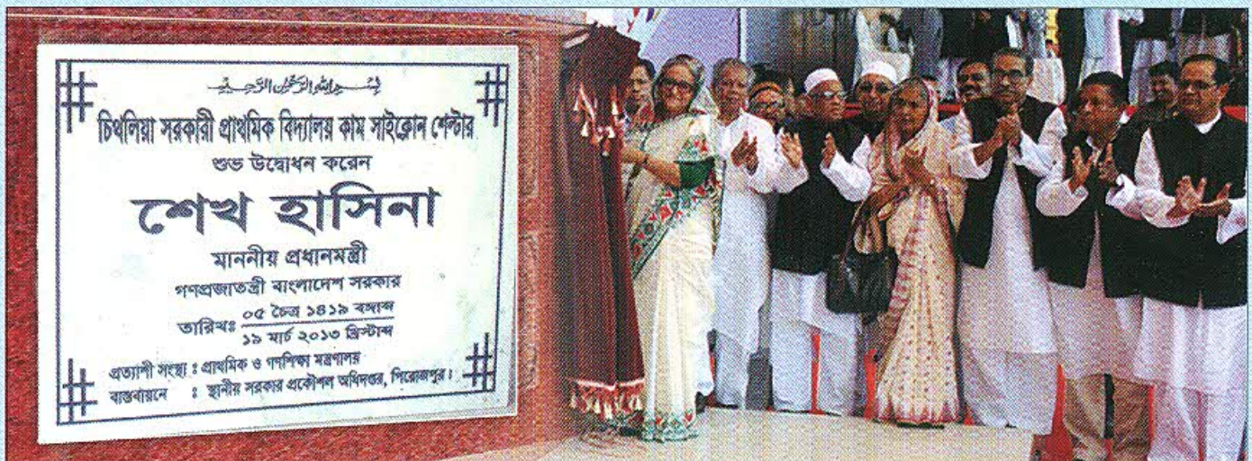
Prime Minister Sheikh Hasina laid the foundation stone of five primary school-cum-cyclone shelters in Patuakhali on 19 March 2013 to be constructed by LGED's ECRP. The Prime Minister also inaugurated six primary school-cum-cyclone shelters in Pirojpur on the same day, constructed by LGED's ECRP.

The Rajdhani Unnayan Katiripakha (RAJUK), Dhaka WASA and Local Government Engineering Department (LGED) along with an army engineering corps implemented different components of the scheme from 2008. The Bangladesh University of Engineering and Technology (BUET) worked as a consultant.