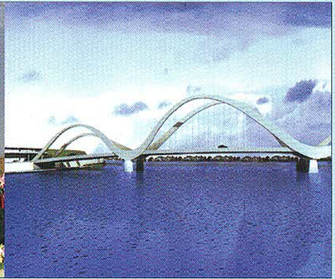
The Hatirjheel-Begunbari project in Dhaka was inaugurated by Prime Minister Sheikh Hasina on 2 January 2013.