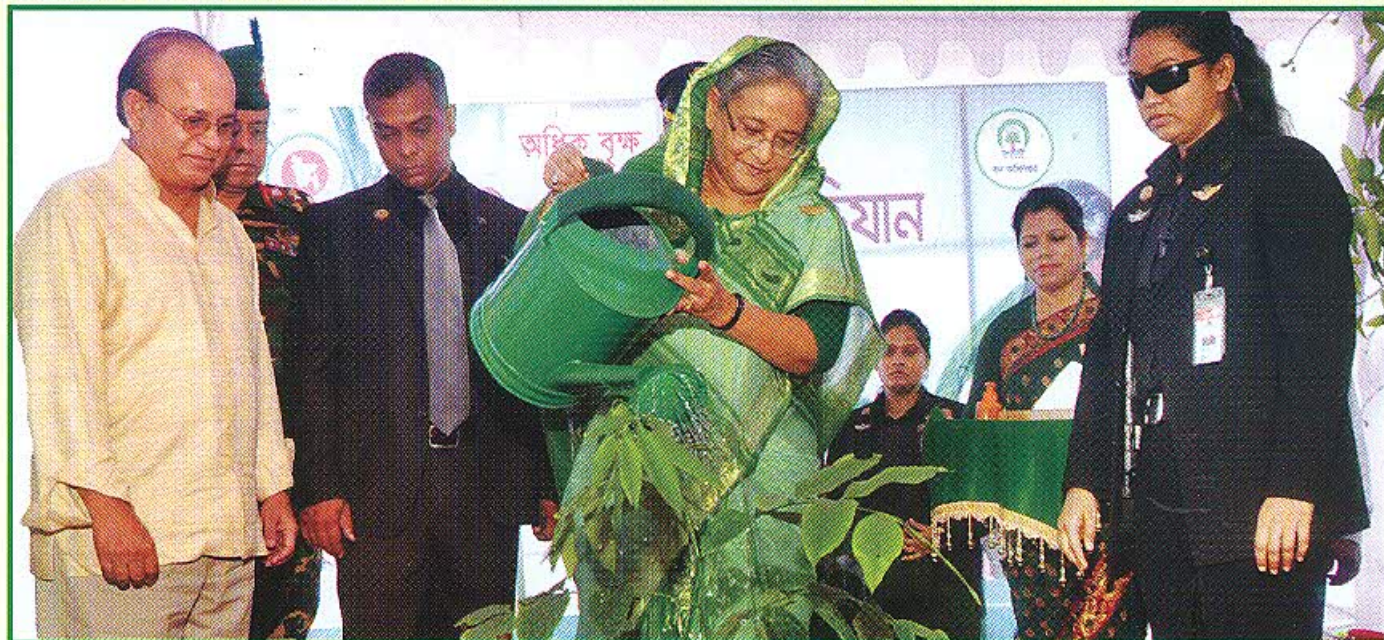
Prime Minister Sheikh Hasina planting a sapling on the premises of Bangabandhu International Conference Centre while she was inaugurating the programme of World Environment Day, National tree plantation programme and a Tree Fair on 5 June 2014.