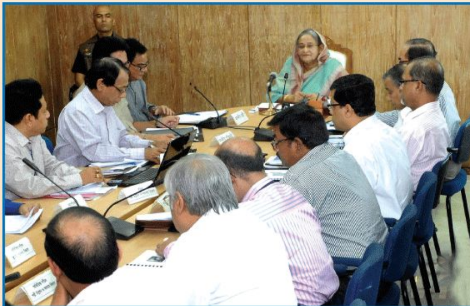
Prime Minister Sheikh Hasina speaking at meeting with the Officials of LGRD & Cooperatives Ministry on 17 July 2014 at the Ministry premises.