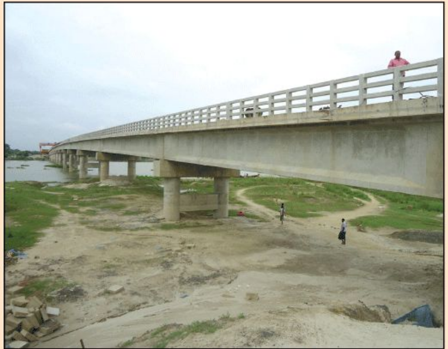
546 meter long bridge over Mahanda river in Sadar Upazila at Chapainawabganj district