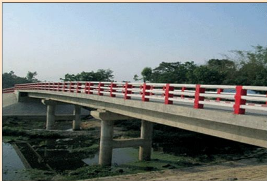
48 metre long bridge over Ramdara River in Thakurgaon district

At least 2 lacs people will get benefit by virtue of the construction of the bridge. Farmers could easily carry their excessive agro products to the markets and the places across the country to get actual value of their products.