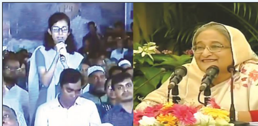
Honourable Prime Minister Sheikh Hasina talking to local beneficiaries while inaugurating various physical infrastructures built by LGED through video conference from Gana Bhaban

Honourable Prime Minister Sheikh Hasina has said the achievements of Bangladesh in reaching the highway to development during the last decade is remarkable and termed it as “making impossible possible”. She said, “I don’t know whether any country in the world could perform such massive development works within this short period. But we have accomplished that mission and Bangladesh has to go far ahead.” Honourable Prime Minister made the remarks while inaugurating 33 developing works in 20 districts through video conference from Gana Bhaban on 11 October, 2018.