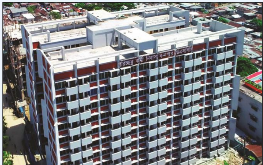
Newly constructed residential buildings for city cleaners

Government Engineering Department is implementing the construction work of these residential buildings. With implementation of the project, a total of 1,148 families of cleaners will get modern and time befitting residential facilities. The floor area of each flat is 472 square feet and there are two living rooms, kitchen, one toilet and two verandas. Every building has lift and generator facility for power supply round the clock and there is provision for separate electric sub-station at each colony. The floor of the flat is covered with tiles. There is separate store room and a community hall at every building.