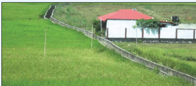
Anandanagar under Khagrachari Municipality now free from water logging