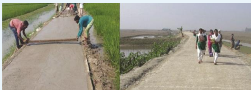
Workers busy in the construction of submersible road