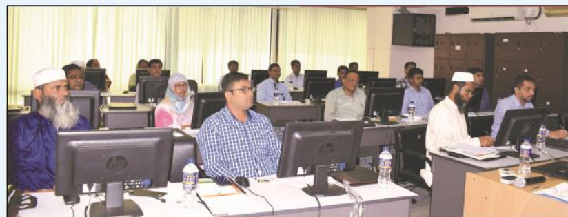
Trainees at training session

in the training. The application is already in use in the monitoring of quality standard of the on-going civil works at field level. Pictures of the civil works, video recording, filling up of inspection form can be shared from the project site with the authority concerned through this mobile application. The special feature of this application will enable the users to design form/template and use them without much complication. Improvement work of the application is currently on to apply in the monitoring of development activities in all sectors of LGED. The information collected through the application can be preserved in mobile phone or in data base for follow up or for future reference.