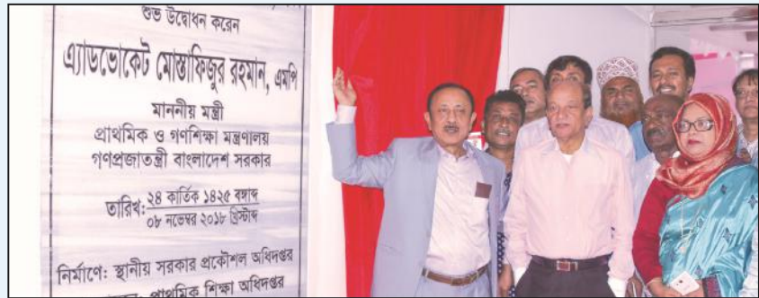
Primary and Mass Education Minister Advocate Mostafizur Rahman, MP inaugurating the 10 storied building of Dhaka PTI

Honourable Primary and Mass Education Minister Advocate Mostafizur Rahman, MP inaugurated the 10-storied building of Dhaka Primary Training Institute (PTI) built for the training of primary teachers at Mirpur in Dhaka on 8 November, 2018. Speaking as Chief Guest on the occasion, the Minister detailed various activities taken by the present government for the development of education. He said, there is no alternative to education to establish a knowledge-based society. He mentioned that Bangladesh has successfully achieved primary education for all and reached the Millennium Development Goals (MDGs). Gender parity has been established in primary education. He hoped that Primary Teachers' Training Institute will play a pioneering role to develop efficient teaching professionals in the country. In his address as Chairperson of the meeting, local MP (Member of Parliament) Kamal Ahmed Majumder said, the government of Sheikh Hasina is education friendly. The government has arranged mid-day meal