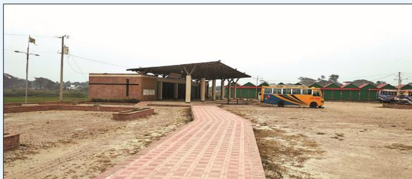
Shibchar Municipality Bus Terminal

There was no bus terminal in Shibchar Municipal area in Madaripur district. Due to chaotic parking culture, accidents were a regular phenomenon. The traffic jam was also commonplace in the area. There was no rest room for the passengers. They had to wait for bus beside the road and had to get on the vehicle with risk. A bus terminal has been recently built at Shibchar