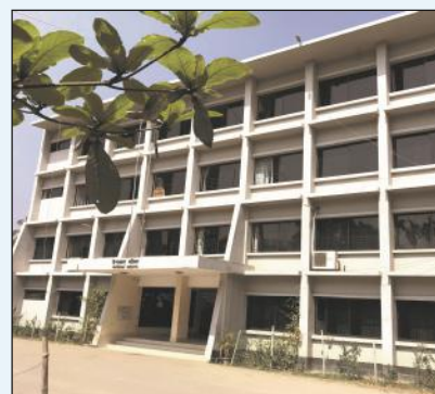
Extension of administrative building of Araihaaz Upazila Parishad

newly created 30 upazila had adequate office space with 40 thousand square feet area which could accommodate offices but the remaining 459 upazila lacked adequate space for housing offices that could cater to the need of the people. In view of this, the upazila parishad extended administrative building and hall room construction project has been undertaken. Under the project, extension work of 233 Upazila Complex have been taken up. The project will be completed within June, 2020.