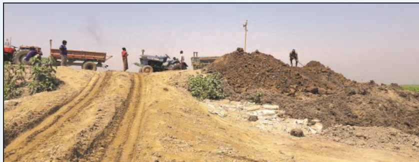
After long 30 years villagers of Kashipur under Nikli upazila of Kishoreganj rebuilding their homestead