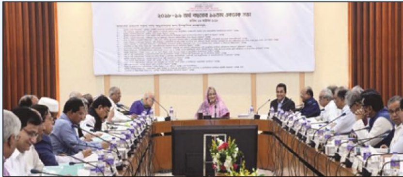
Honourable Prime Minister Sheikh Hasina presiding over ECNEC meeting

Executive Committee of National Economic Council (ECNEC) gave approval to 15 projects for implementation by Local Government Engineering Department (LGED) involving a cost of 16,181.86 crore taka during last October-December 2018. The projects have been approved at several ECNEC meetings presided over by ECNEC Chairperson and Honourable Prime Minister Sheikh Hasina at NEC conference room at