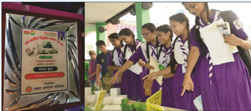
A group of students visiting a stall of LGED set up at Development Fair 2018 held at the International Trade Fair ground in Dhaka

Main objectives of the projects include increasing production in agriculture and non-agriculture sectors through rural communication infrastructure development and maintenance, expansion of trade and commerce, employment creation, poverty alleviation and improvement of lifestyle. At the same time, providing services to community through sustainable and planned city infrastructure development.