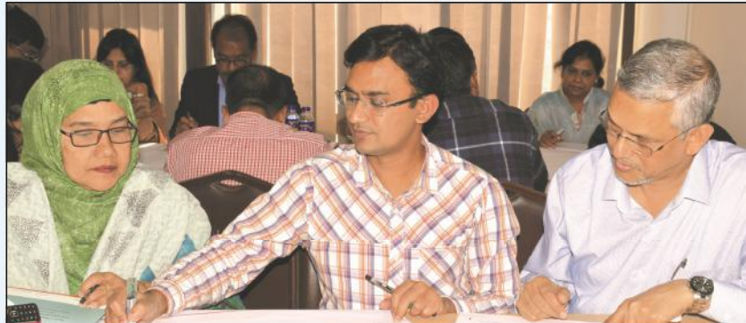
Group work at the workshop

The physical infrastructures built across the country are faced with various problems caused by climate change and natural disaster. There is no alternative to the construction of climate resilient infrastructures for sustainable development. With this end in view, the innovative technique has to be evolved through conducting research.