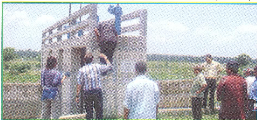
A Review Mission of Asian Development Bank and the Embassy of the Netherlands in Dhaka visited a sub-project under Second Small Scale Water Resources Development Sector Project (SSWRDSP) of LGED.

A joint loan review mission of Asian Development Bank (ADB) and the Embassy of the Kingdom of the Netherlands (EKN), Dhaka reviewed the overall progress of the implementation for the Second Small Scale Water Resource Development Sector Project from 01 June to 11 June, 2009. The mission visited six subproject sites in Sylhet, Sunamganj, Moulvibazar and Hobiganj districts. During the visit, the Mission held