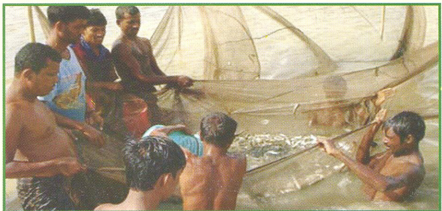
Photo shows the members of the Community Based Fisheries Management are enjoying their right to catch fish under the SCBRM Project, LGED.

Earlier, an address of welcome followed by a presentation on the evolution of LGED as an implementing agency of rural infrastructure