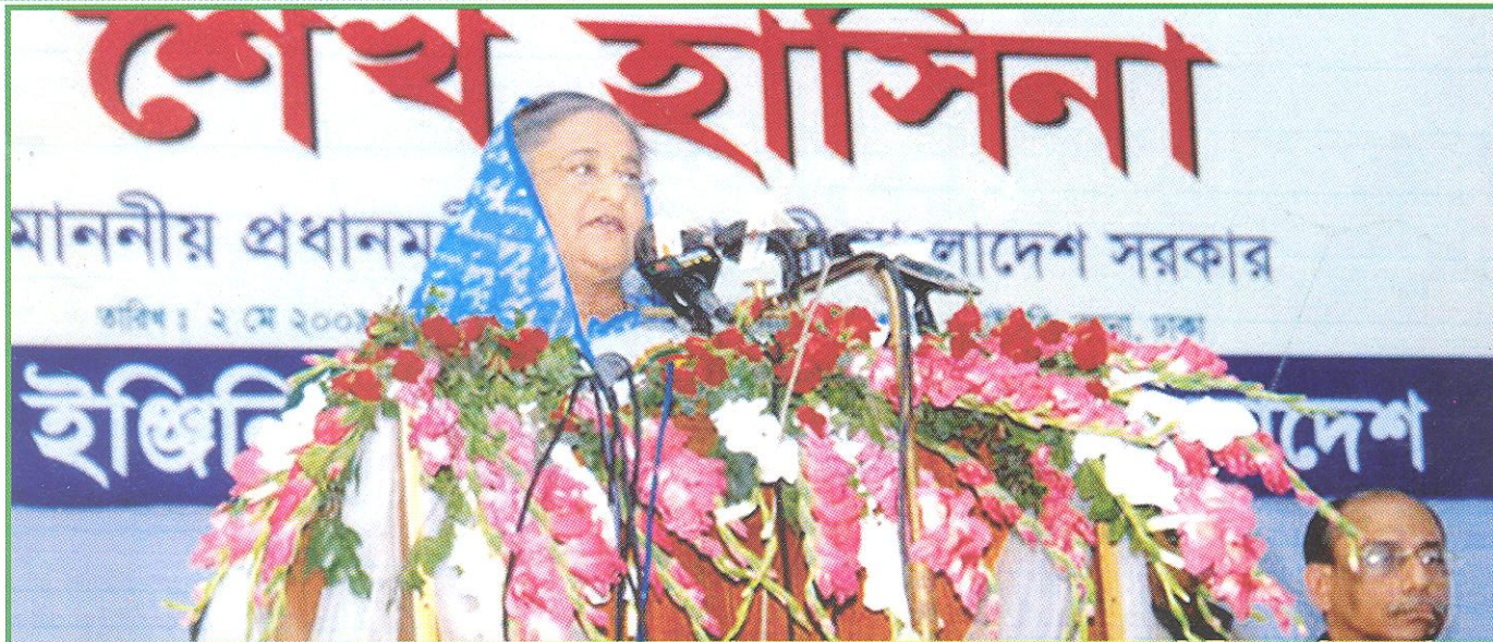
Prime Minister Sheikh Hasina is seen addressing the engineers of the country at the inaugural ceremony of the 61st founding anniversary of the Institution of Engineers, Bangladesh in Dhaka on 2 May 2009.