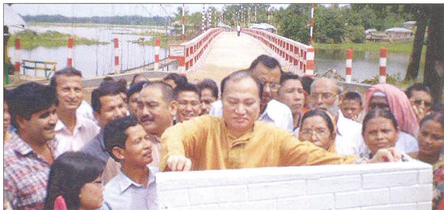
Mr. Dipankar Talukder, MP, State Minister for Chittagong Hill Tracts Affairs inaugurated the bridge on Bilaichari sadar-Farua Bazar Road in Rangamati on 5 October 2009.

Under CHTRDP upgrading basic rural infrastructure of upazila & union roads including bridges and culverts are being implemented by Local Government Engineering Department (LGED). A total 56 km. of 5 (five) upazila road including 1390 m bridge/culvert and 197 km. of 32 (thirty two) union roads including 2950 m bridge culvert have been constructed. A total of 2040 small community based subprojects under the CD component were implemented in 111 unions of three hill districts. The subprojects were classified as economic and social category, irrigation/agriculture sub-project under