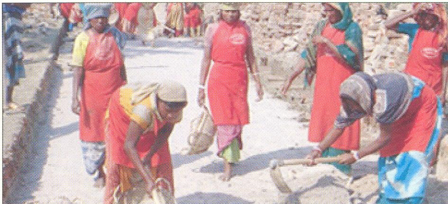
Women members of the LCS are seen engaged in road maintenance work under RRMAIDP

scheme implementation, LCS women are given training on awareness raising and skill development, income generating activities and functional literacy. A total of 8170 women have received functional literacy training under RRMAIDP. The project has