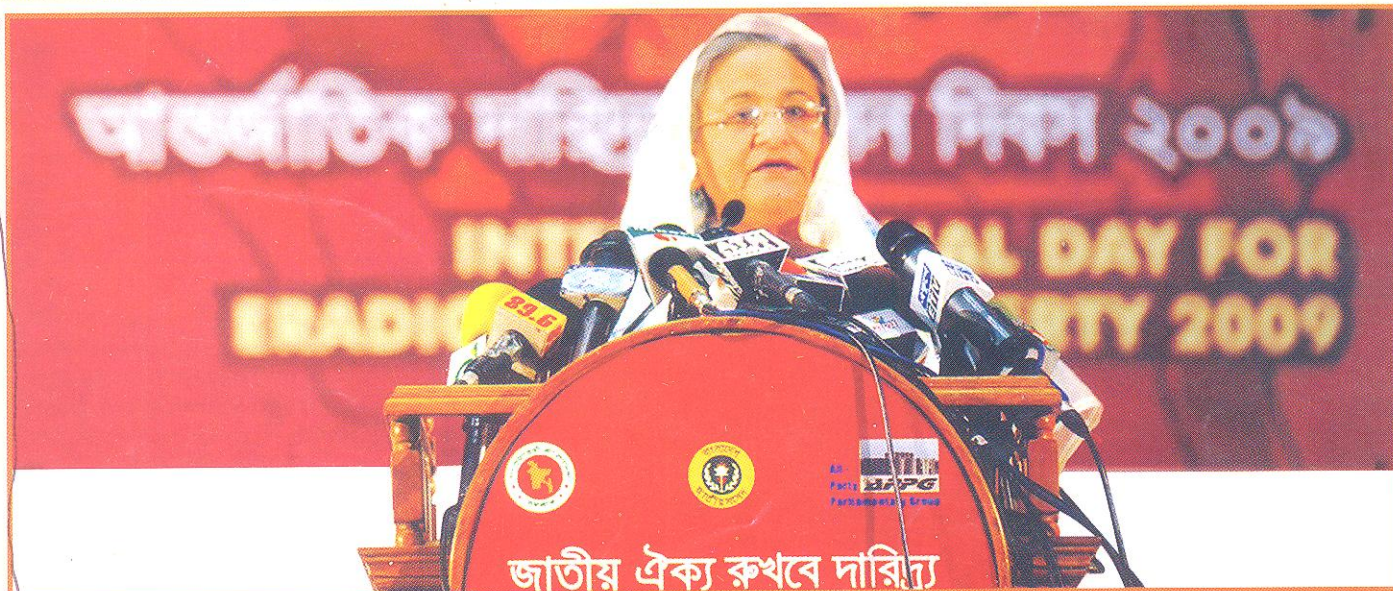
Prime Minister Sheikh Hasina is seen addressing an anti poverty rally in observance of the International Day for the Eradication of Poverty in Dhaka on 17 October 2009.