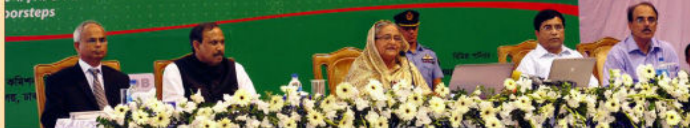
Prime Minister Sheikh Hasina inaugurated a three day Digital Innovation Fair 2011 at Bangabandhu Sheikh Mujibur Rahman NOVO Theatre in Dhaka on 6 July 2011.