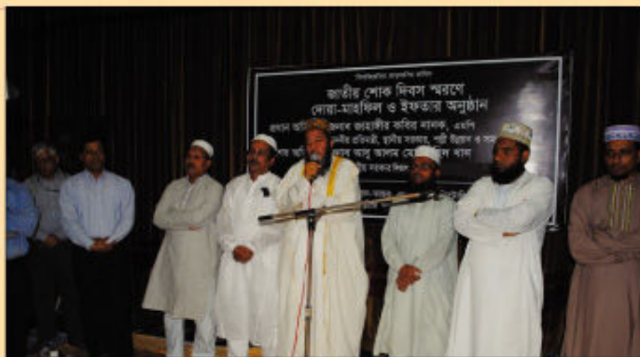
State Minister for LGRD & C Mr. Jahangir Kabir Nanak along with officers and staff of LGED and LGD offering Munajat at a Doa Mahfil to mark the National Mourning Day of August 15 at the LGED HQ on 21 August 2011

Terming LGED as the prime body to march ahead for development by salvaging Bangladesh from all sorts of conspiracy, the State Minister for Local government, Rural Development & Cooperatives, Mr. Jahangir Kabir Nanak, MP said, LGED engineers are powerful weapons to realise the dreams of Prime Minister Sheikh Hasina, the daughter of the Father of the Nation Bangabandhu Sheikh Mujibur Rahman. He was speaking as the chief guest at a special Doa-Mahfil and Iftar programme arranged by LGED on 21 August 2011 at LGED Bhaban in Dhaka to mark the National Mourning Day of August 15. The State Minister said, the forces that countered the great Liberation War of 1971 had killed Bangabandhu and his family members in a gruesome murder. He further said, the same conspirators against Bangladesh's independence committed again a well-planned grenade attack on Awami League rally in Dhaka on 21 August 2004 to kill Sheikh Hasina, the then Leader of the Opposition in the Parliament in a bid to make the Bangalees leaderless. He said Sheikh Hasina however escaped the attack by the grace of the Almighty, but 24 of AL party leaders and activists including Begum Ivy Rahman lost their lives. He also added,