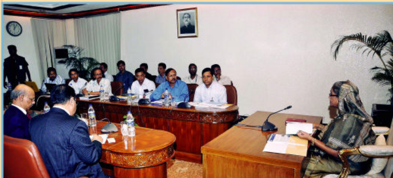
Prime Minister Sheikh Hasina witnessed a presentation on Tongipara and Kotalipara Development Master Plan at her office in Dhaka on 31 July 2011. After the presentation the Prime Minister is seen listening to a briefing on the short-term, mid-term and long-term development plans under Upazila Complex Extension Project for those two areas in the district of Gopalganj.