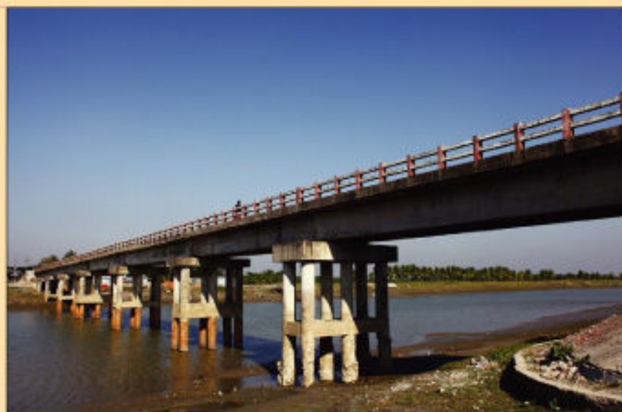
A partial view of a bridge constructed under CDSP over Mamur Khal near Janata Bazar under Hatia Upazila

Local Government Engineering Department (LGED) had been one of the key implementing agencies in three successive phases of Char Development and Settlement Project (CDSP) from 1994 to 2010. The project areas included the districts of Noakhali, Chittagong, Lakshmipur and Feni. Main activities included in CDSP were construction of rural roads, bridges and culverts, multipurpose cyclone shelters and community ponds. In the first phase of the project, (1994-1999) deep tube-wells and sanitary latrines were installed in three 'Chars' - Char Majid, Char Baitirtek and Char Baggar Dona II. Later, an incisive effort was undertaken to improve the socio-economic conditions of the landless and destitute Char people of Bangladesh by creating employment opportunities.