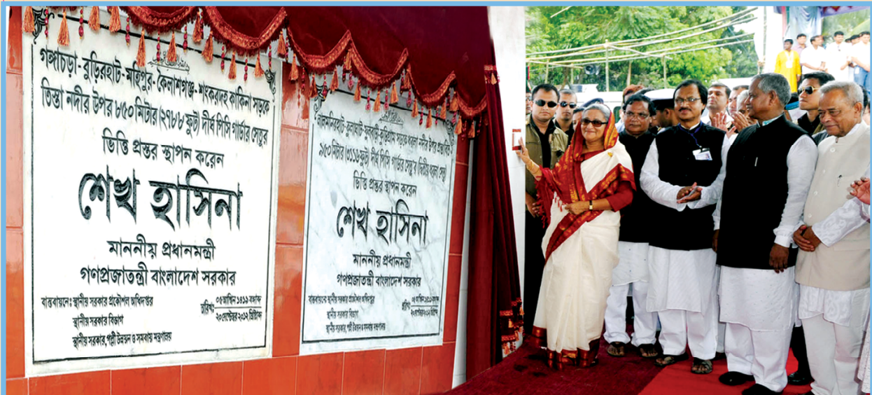
Prime Minister Sheikh Hasina laid the foundation stone of a bridge on Teesta river and the second Dharla Bridge at Kulaghat-Fulbari point in