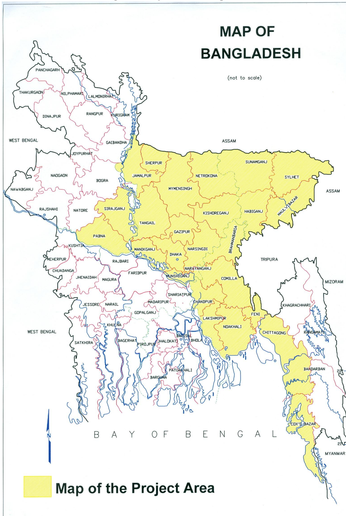
Figure – 1 Project Location Map (RTIP-II)