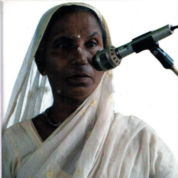
BUG & LCS member, Sunamganj, CBRMP, LGED