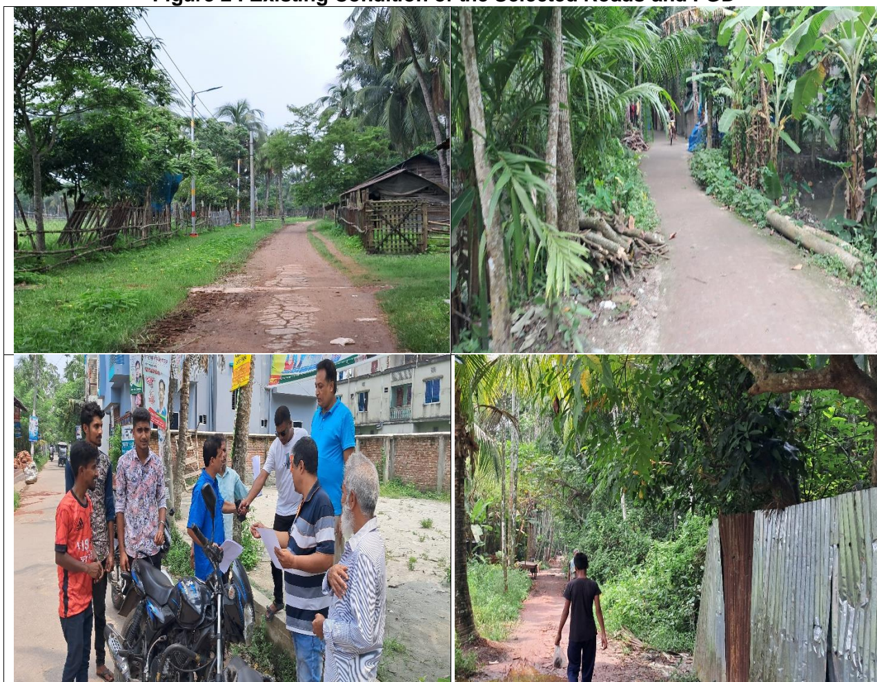
Figure 2 : Existing Condition of the Selected Roads and FGD

39. Refer to Figure 2 for the Photograph Plates of the FGD held at the respective road sites, Refer to Appendix 3 for the record of the consultation meeting.