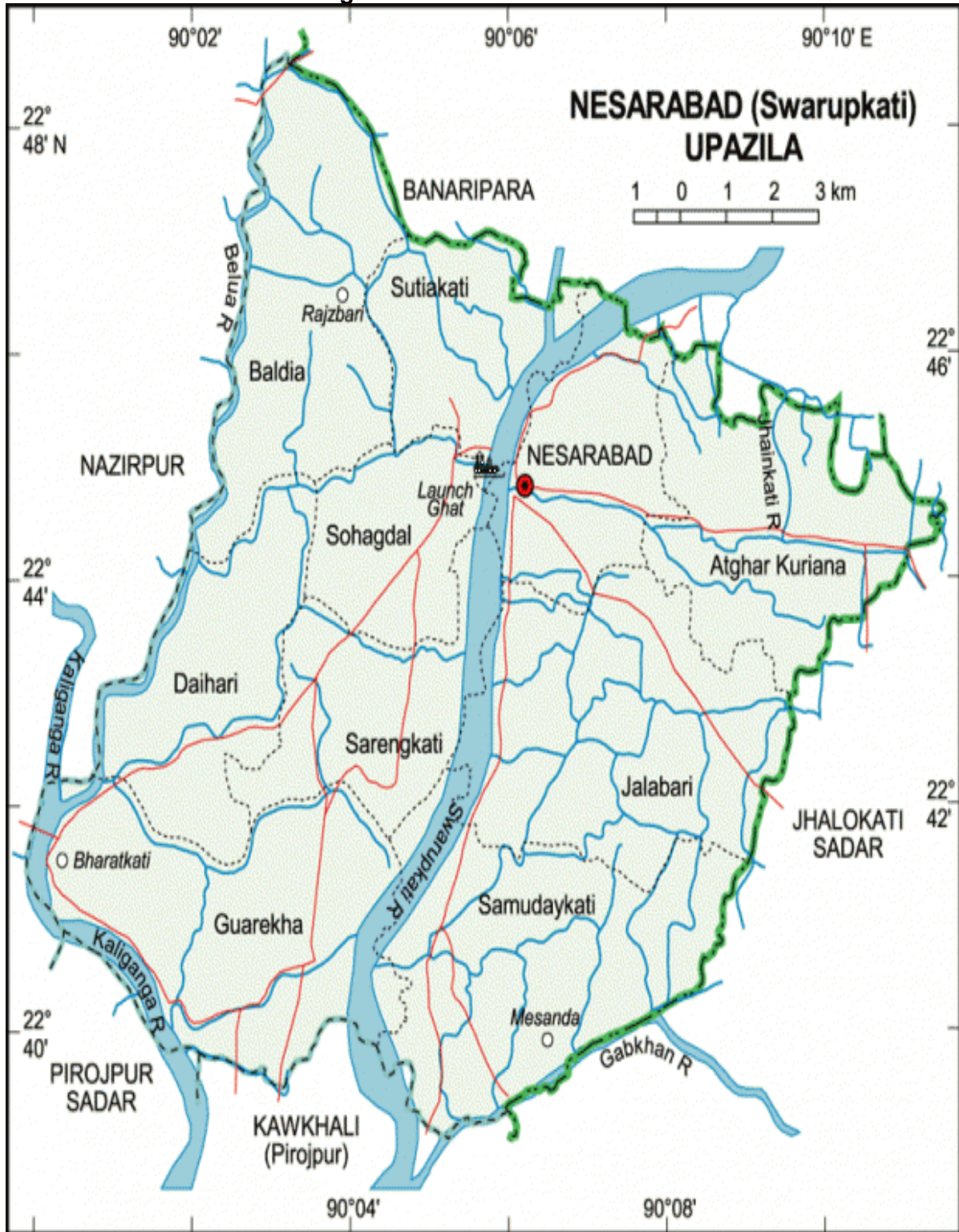
Figure 1: Location of Roads