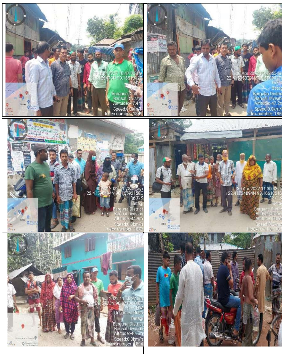
Figure 2 : Existing Condition of the Selected Roads and FGD