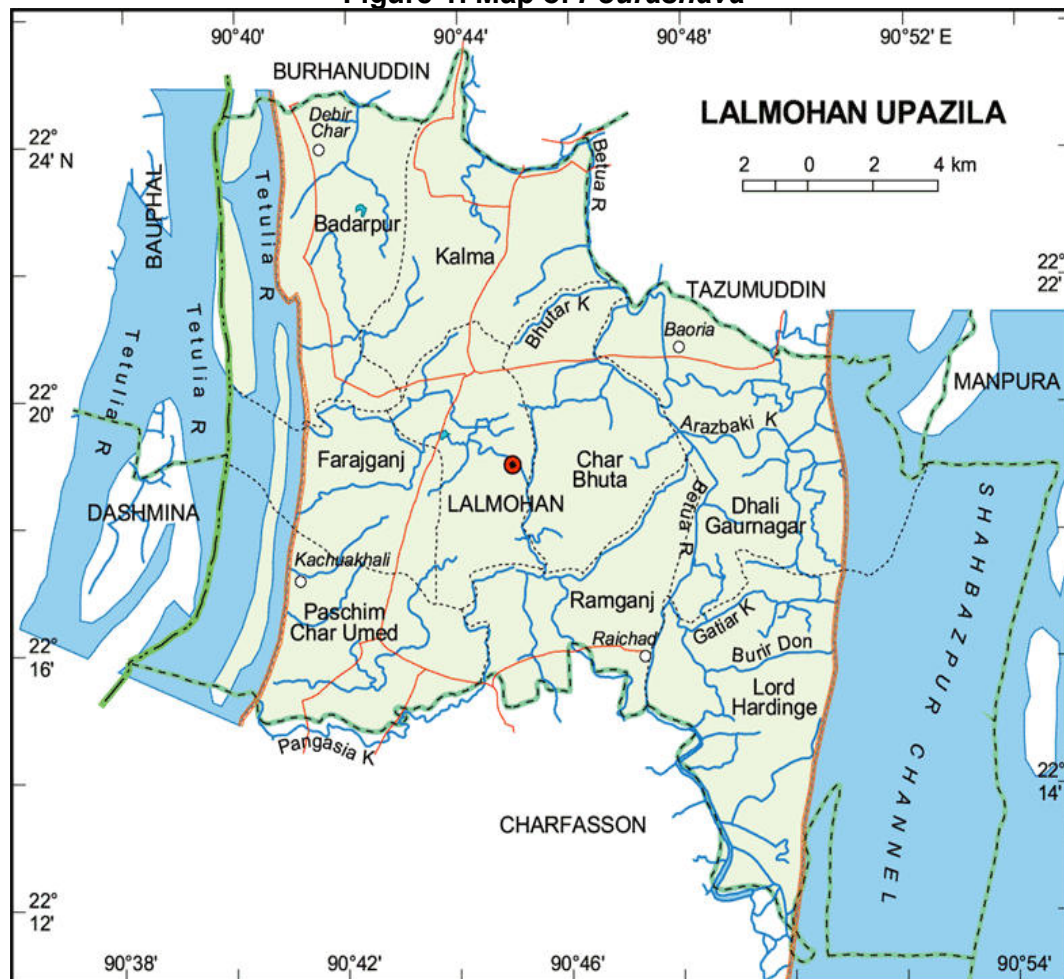
Figure 1: Map of Pourashava