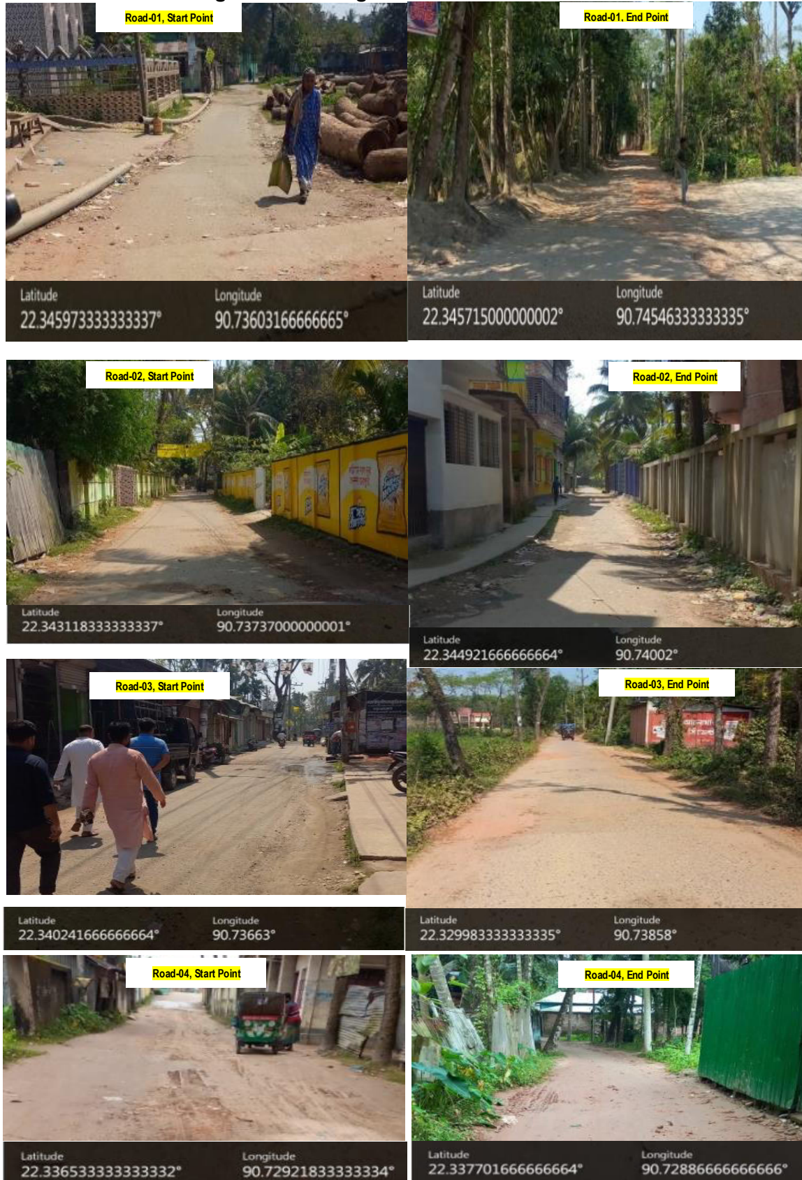
Figure 4: Existing Condition of the Selected Roads