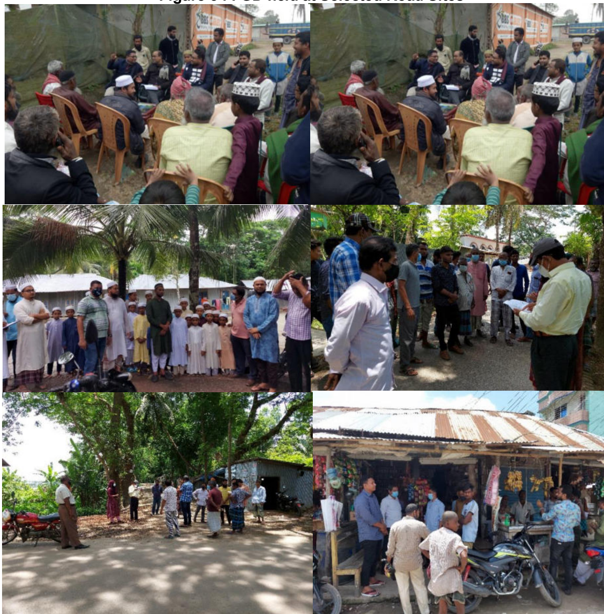
Figure 3 : FGD held at Selected Road Sites

44. Photographs Plates of the existing roads to be improved in Figure 4 .