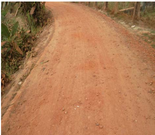
Views of the Completed Road