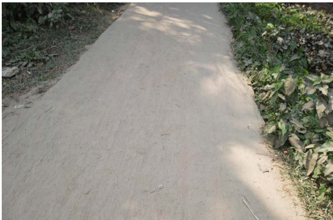
Views of Completed Road.