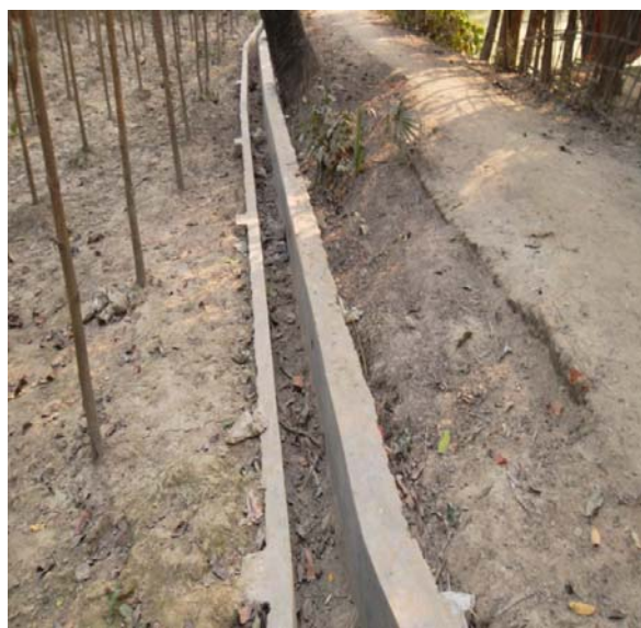
On-going drain constructed along the road