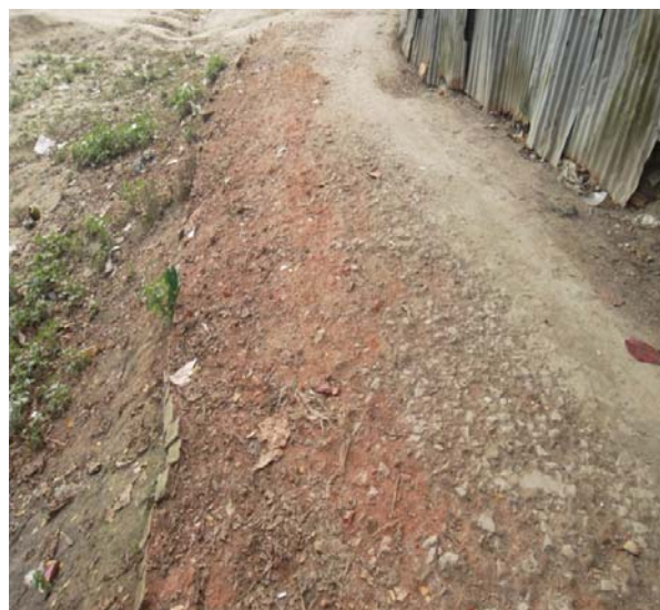
Views of road proposed for improvement