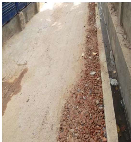
Views of proposed road