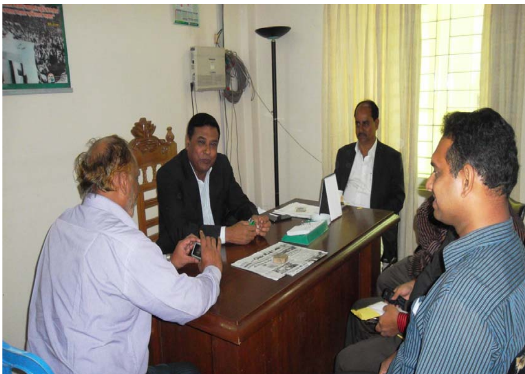
Consultation with the Pourashava Officials