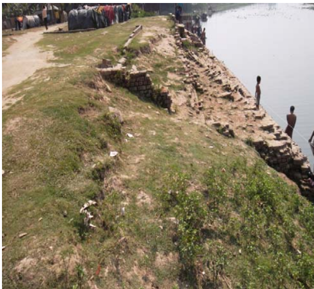
Views of proposed brick guide wall