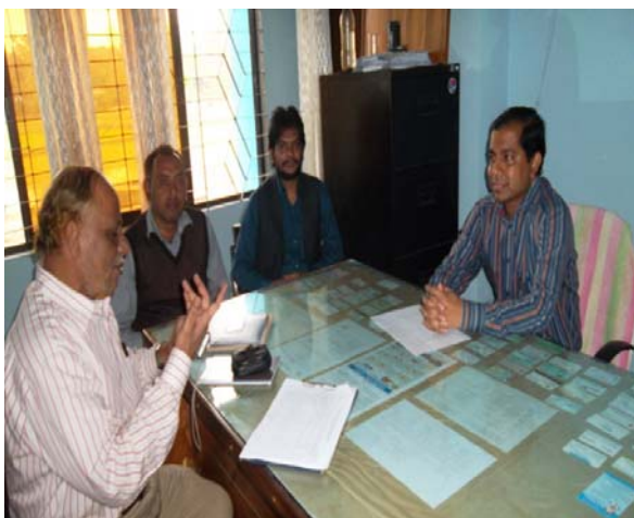
Consultation with the Pourashava Officials