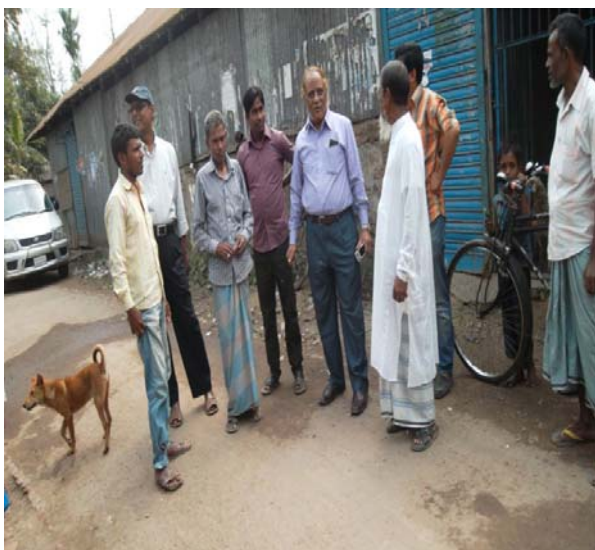
Consultation with the local people