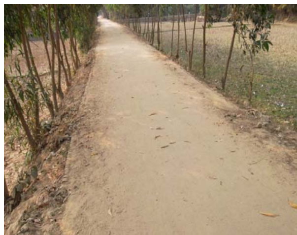
Views of the Completed Road