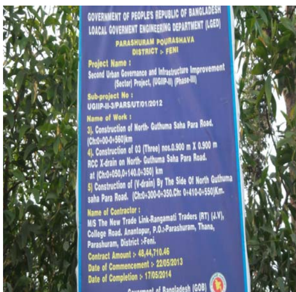
Project information Board. – A good practice