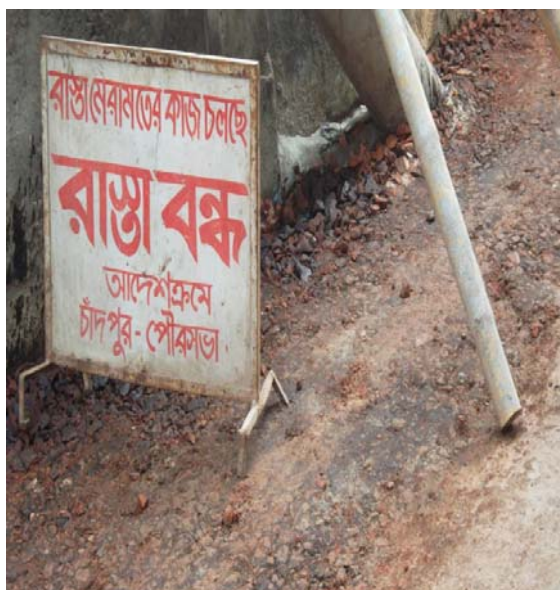
Sign of good practice of Contractor