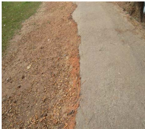
Views of road proposed for improvement