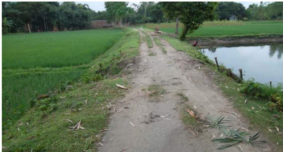
View of Proposed road