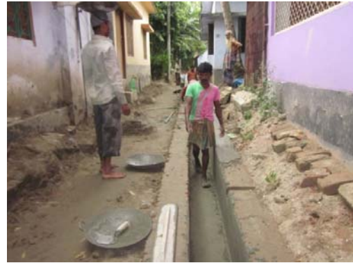
Labours are working without any PPE.(PDP-35)