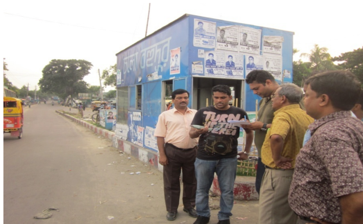
Survey team measuring noise at the proposed project site