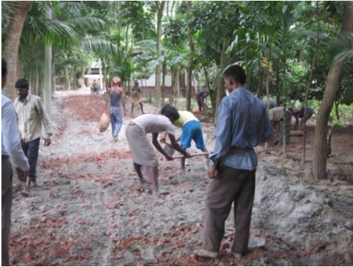
Labours are working without any PPE.(PDP-25)