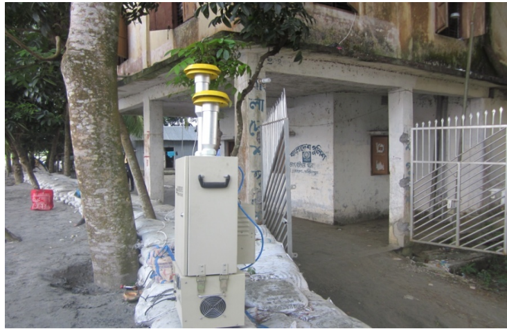
Survey team collecting Ambient Air Quality data