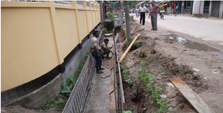
View of drain under construction