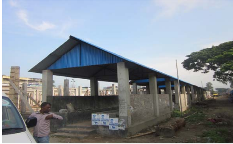
View of ongoing Kitchen Market under Construction