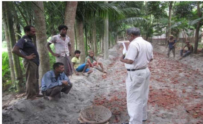
Consultation with Labours.(PDP-35)