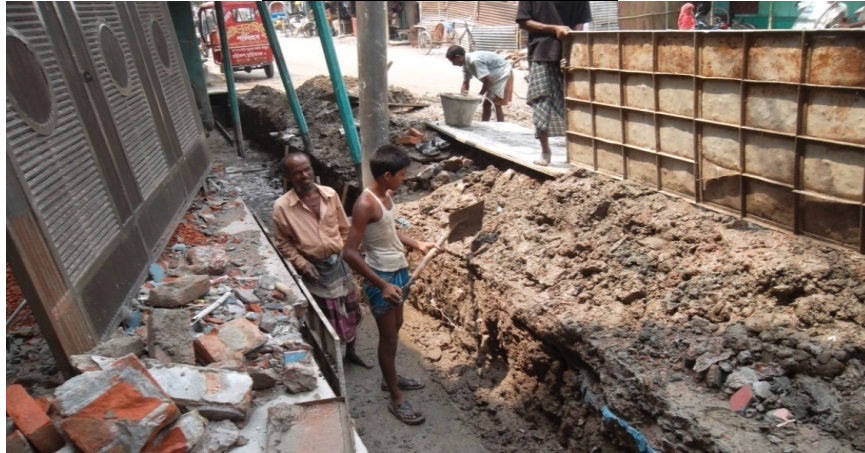
View of drain under construction