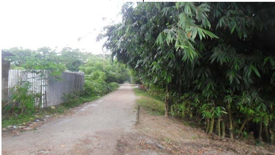
View of Proposed road