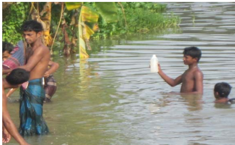
Survey team collecting surface water sample