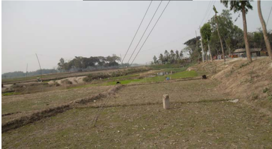
Proposed location of Bus Terminal