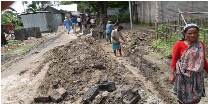
View of drain under construction