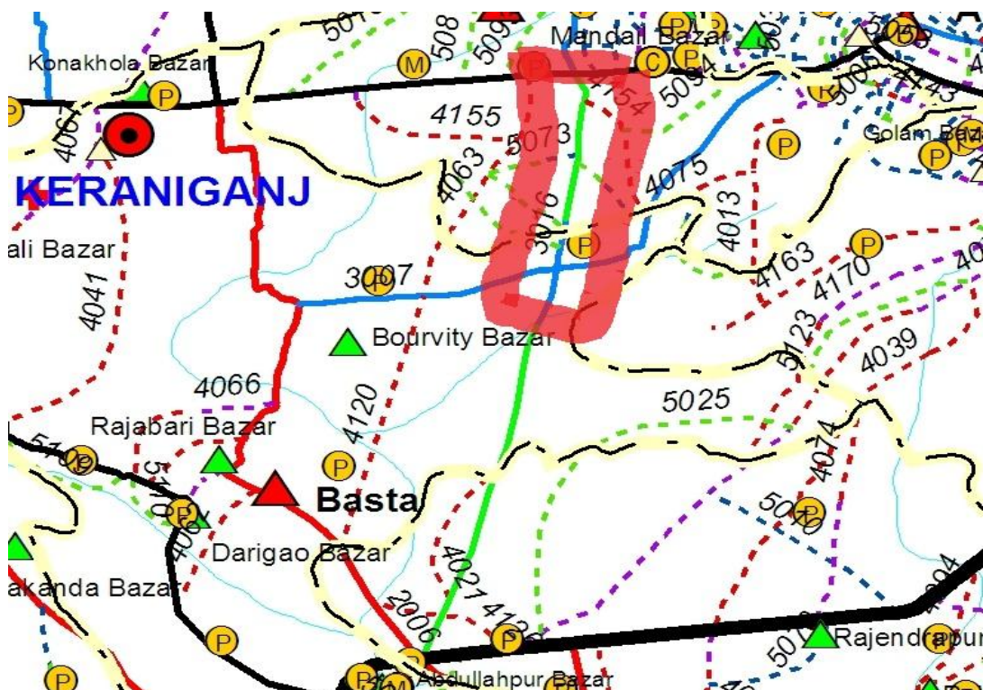
Location map of the sub project