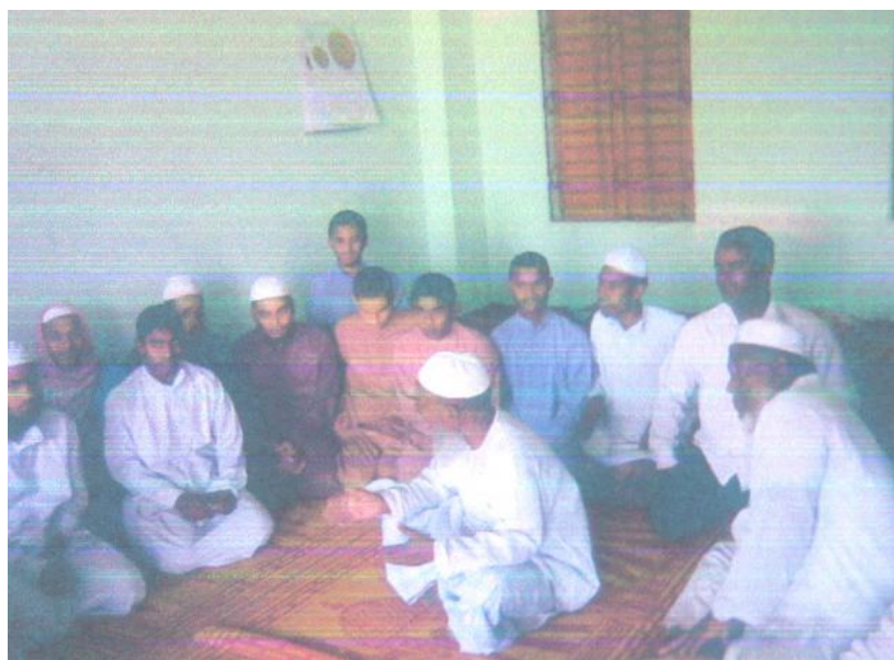
Photograph of the Public Consultation