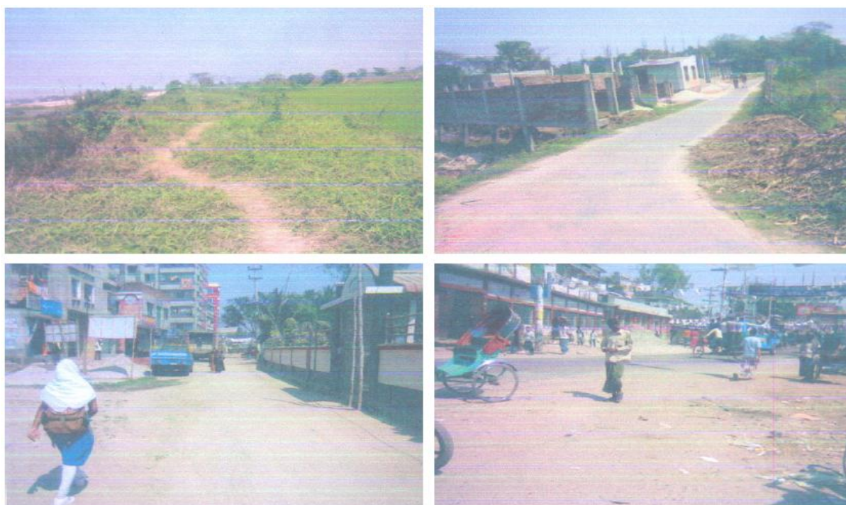
Photograph of the proposed Road

Union road (UNR) improvement includes construction of bituminous road on the existing earthen road. The road has a length of 2.777 km. Major components of the works includes earthwork (earth volume 28001 cum), base coarse Improve sub grade, Brick at edge, 25mm dense carpeting etc. Drainage Structure such as Box Culvert at chainage 1785m and 2910m, Protective work such as Palisadings at chainage 1500m to 1580m (80m), Guide wall of 225m without CC Block is required from at chainage 875m to 1100m.