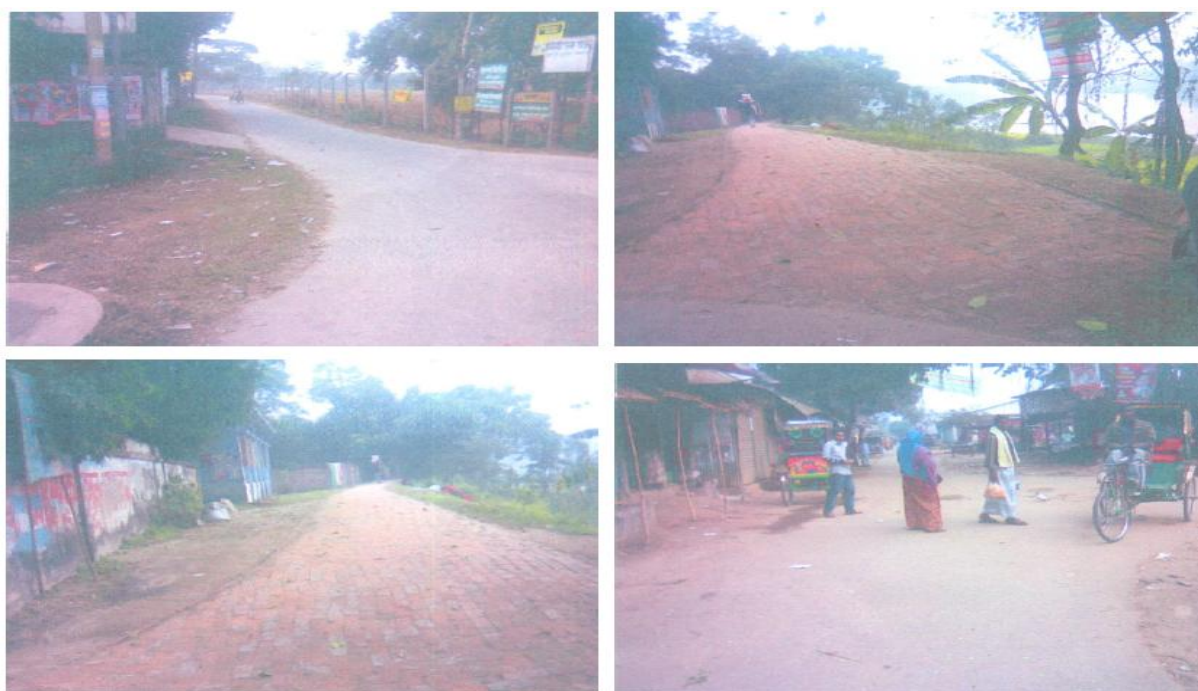
Photograph of the proposed Road

Union road (UNR) improvement includes construction of bituminous road on the existing earthen road. The road has an effective length of 3.56 km starting from 1+000 km. Major components of the works includes earthwork (earth volume 17292.612 cum), base coarse Improve sub grade, Brick at edge, 25mm dense carpeting etc. Drainage Structure such as Box Culvert is required at chainage 1155m, 1132m, 1540m, 1695m, 2960m, 3460m, 3635m, 4050m, 4465m and 2446m, U-drain at chainage 1320m to 1440m, 1710m to 1850m, 4340m to 4400m and 4401m to 4418m and Cross drain at chainage 4340m and 4400m.