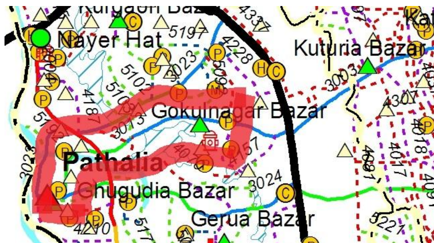
Location map of the sub project