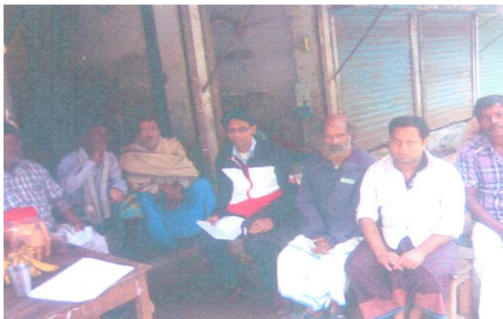
Photograph of the Public Consultation