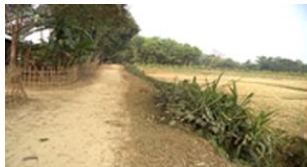
Photograph of the proposed Road