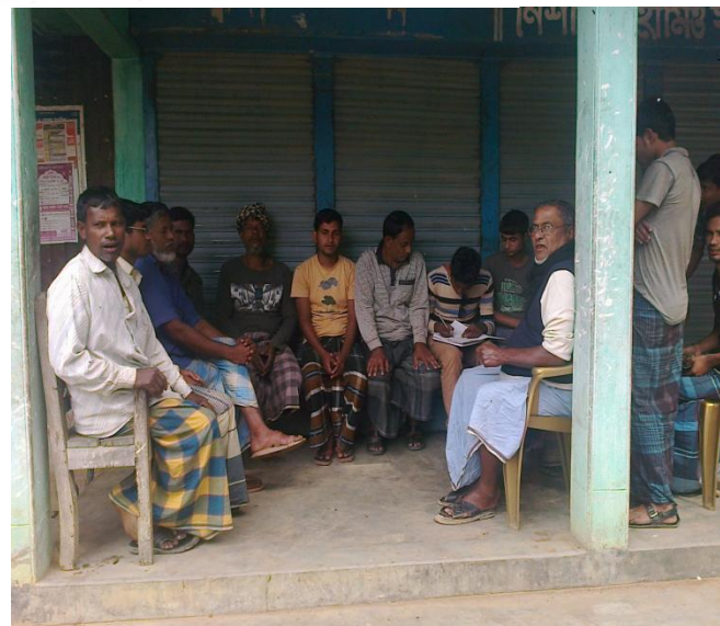
Photograph of the Public Consultation