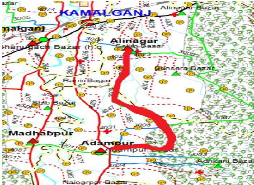
Location map of the sub project