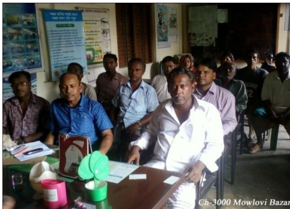
Photograph of the Public Consultation