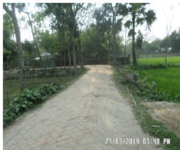
Photograph of the proposed Road