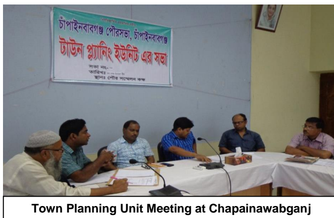
Town Planning Unit Meeting at Chapainawabganj

Town Planning Unit has been established in all the 31 pourashavas. All pourashava arranged their quarterly Town Planning Unit meeting. In their meeting they have discussed various agendas such as PDP implementation progress, Town Planner recruitment and Master Plan preparation, Building plan approval database preparation, effective O& M plan implementation progress, slum development progress, drainage, sanitation, street lighting and maintain GRC to record complain related to land boundary, building plan and construction, play ground, open space, mountain ,drainage, sanitation or other development related complain to ensure better urban services.