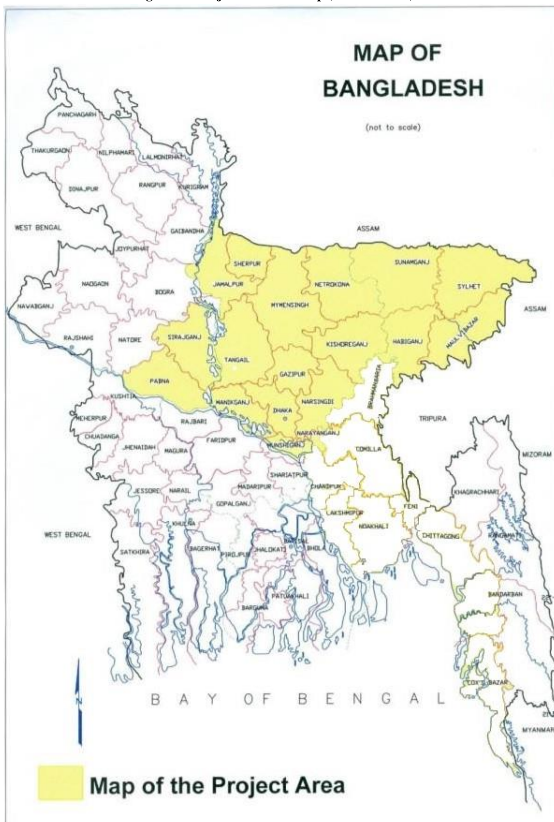
Figure – 1 Project Location Map (RTIP-II : AF)