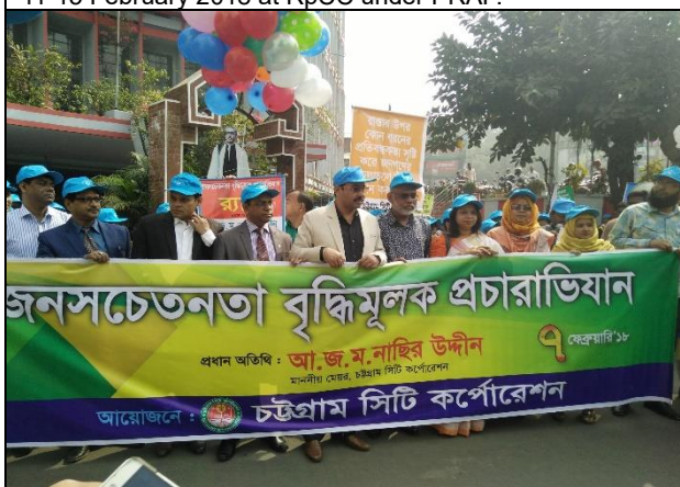
Awareness campaign held on 7 February 2018 at ChCC