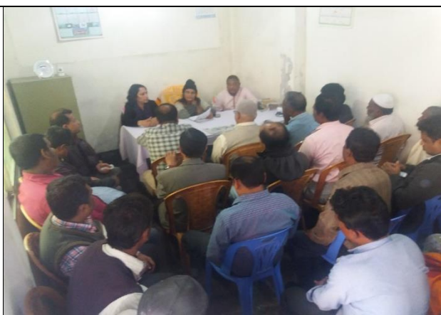
Meeting with CG members on 5 February 2018 at RpCC.