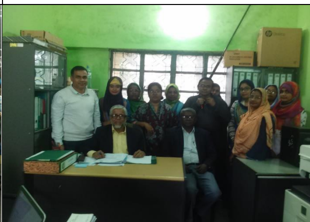
Provide on the job training to the Community Workers on Book Keeping record under PRAP on 5 February 2018 at CoCC.