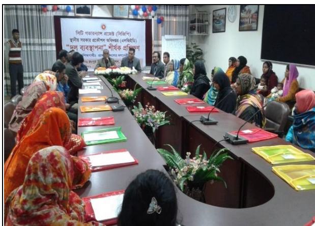
Group Management Training for primary group leaders on 11-15 February 2018 at RpCC under PRAP.