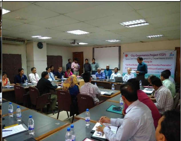
Workshop on City Beautification and Environmental Protection/Preservation Workshop on Comprehensive Urban Planning, Building and Land Use Control on 12-13 March 2018 at LGED HQ for CC Officials