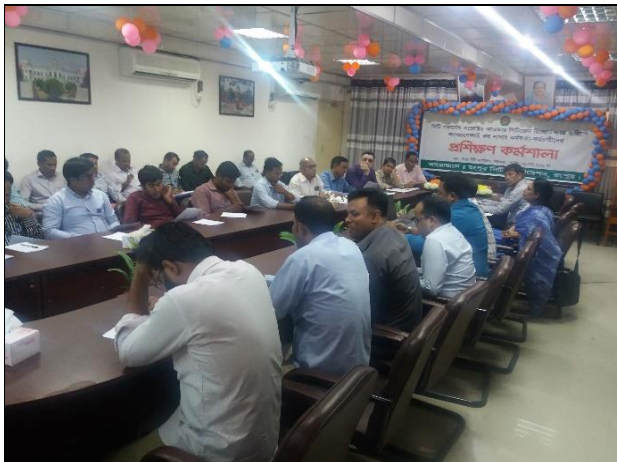
Organized training on CRC Survey methodology and filled-up questionnaire on 21 March 2018 in RpCC