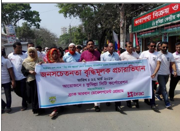
Awareness campaign organized by CoCC on 22 March 2018