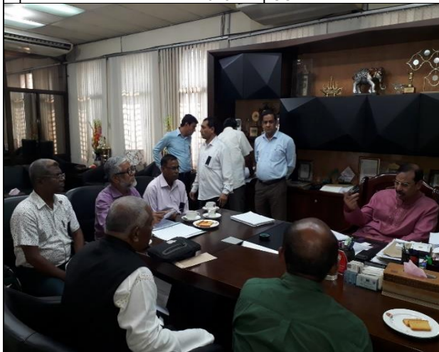
Meeting with Secretary of ChCC regarding CRC survey on 12th March 2018