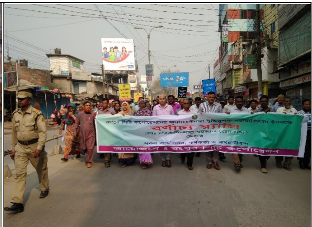
Conduct Awareness Campaign by RpCC on 22 March, 2018.