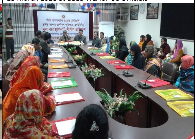
Organized "Group Management" Training for the PG Leaders under PRAP on 11 March 2018 in RpCC