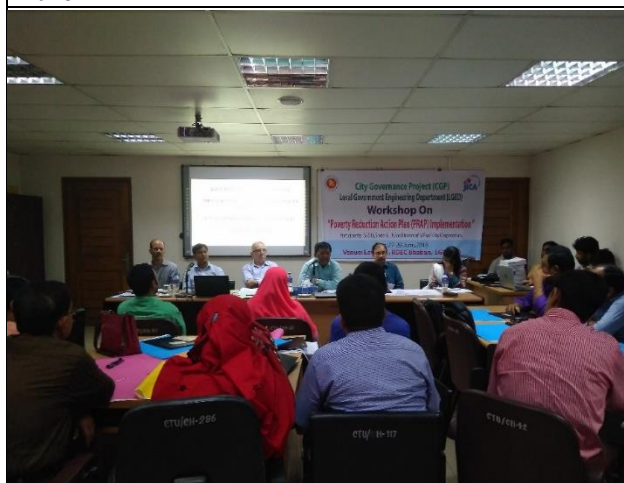
Organize Workshop on PRAP Implementation for relevant officials of 5 CCs at LGED HQ, on 27 & 28 June 2018