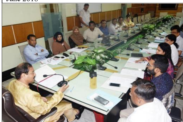
Meeting of Standing Committee of Health and Education held on 16 June 2018 at ChCC