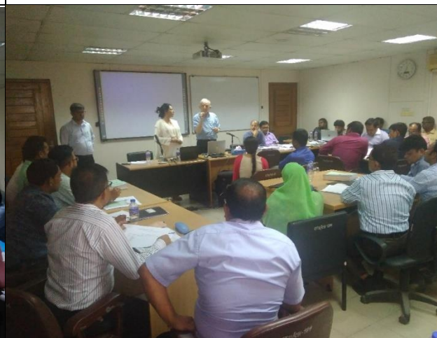
TL (GII) discussed in the workshop on PRAP Implementation for planning and monitoring the PRAP activities on 27 & 28 June 2018