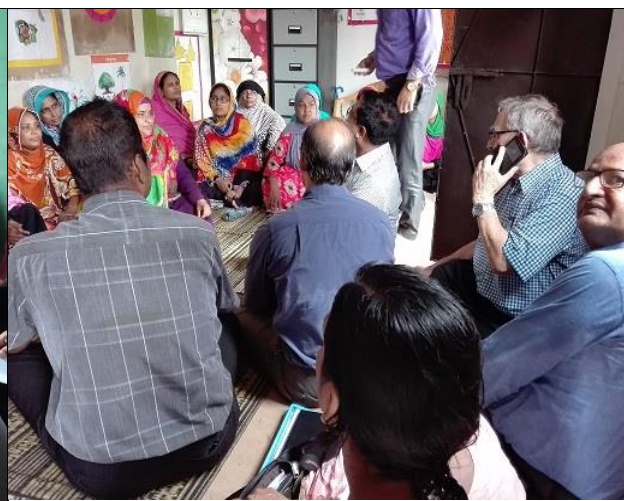
Meeting with PG Leaders of CDC 2 & 3, Package No. 3 under PRAP at Tongi Zone of GCC on 11 June 2018