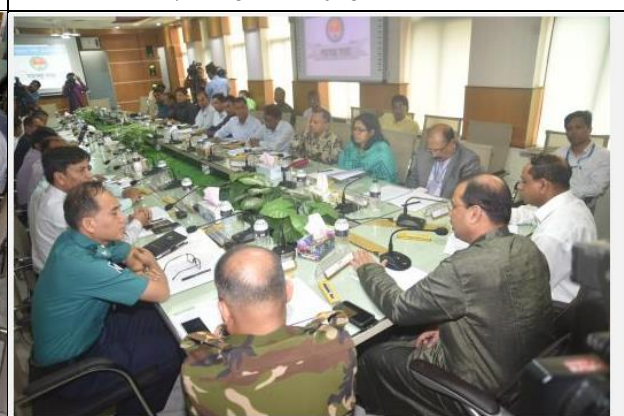
Meeting on City Development Coordination Committee (CDCC) held on 24 June 2018 at ChCC