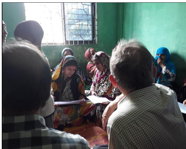
Meeting with PG Leaders of CDC 2 & 3, Package No. 8, under PRAP at Kadamrasul Zone of NCC on 4 June 2018