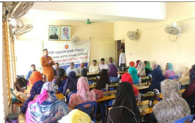
Inauguration session for IGA Training for 30 PG members at CuCC started on 28 October 2018 for 21 days.