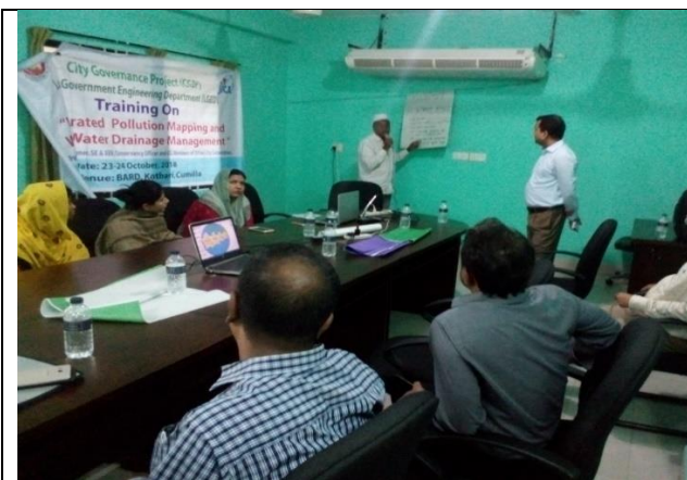
Participants presenting findings of field visit in the Training on Pollution Mapping on 23 October 2018 at Cumilla BARD.