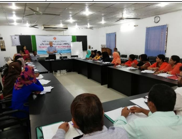
Team Leader, CGP guided the Satellite School Teacher Refresher Training organized undero on 22-25 October, 2018 at BARD, Cumilla