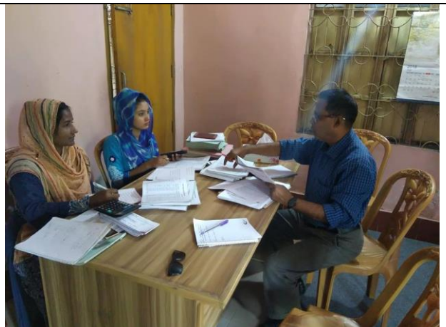
On 23 rd October 18, checking master roll register for loan at package no 01 ( RAJA Para) in Cumilla City corporation.