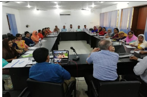
Refresher Training for School Teachers under PRAP on 22-25 October, 2018 at BARD, Cumilla.