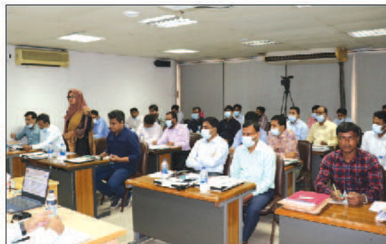
A view of Progress Monitoring & Review Meeting (Engineering, Institutional & Training) attended by District Outsource Assistant Engineer, Sociologist, Sub-Assistant Engineer, Agri and Fish Facilitator held at LGED HQ on 12-06-2022.