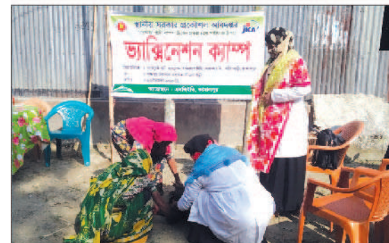
The Vaccination Camp is on-going at Pakadubi Subproject (SP-35232) Sharishabari upazila, Jamalpur district on 10-05-2022.