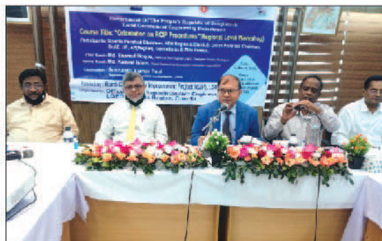
RCIP: Inaugural Session of the Orientation on RCIP Procedures Held in RTC, LGED Cumilla