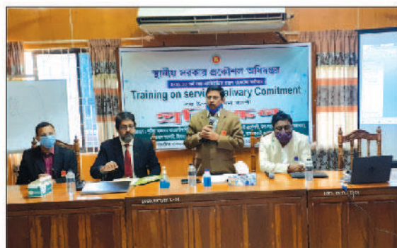
A view of the training course on Service Delivery Commitment for the official of LGED held at Kustia on 23/12/2021.