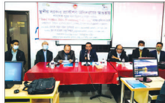
IPCP: Inauguration of the Training on Total Station Data Processing Software, RTC, LGED, Dhaka. (IPCP)