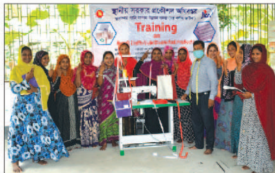
An instructor was seen with the participants of Training on "Handi Crafts/Jute Diversified and others" Rathkhola-Kamarbari Subproject (SP-32017) Sharishabari, upazila, Jamalpur district at 15-03-2022.