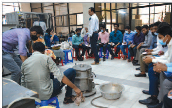
Provati: Demonstration session of Quality Control (Cement Bitumen, and Concrete - QCT 2) training at CTU, Dhaka.during 24-28 October, 2021.