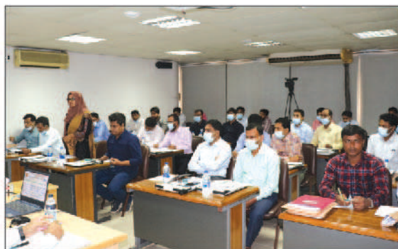
A participant is seen sharing views with the session trainer in the training course on Quality Control (Building Supervision) held at CTU HQ.