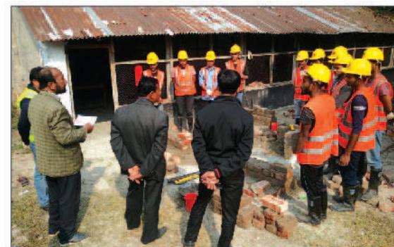
Provati: A view of the Masonry training session at Kurigram,