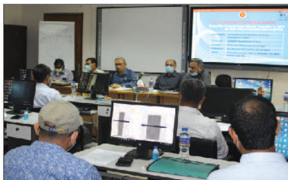
SSSWRDP: Project Director is seen to address the participants of the Training on Computer based Estimate Preparation (RSEPS) and Earth Volume Calculation (EVCS) Software held at HQ under SSSWRDP.