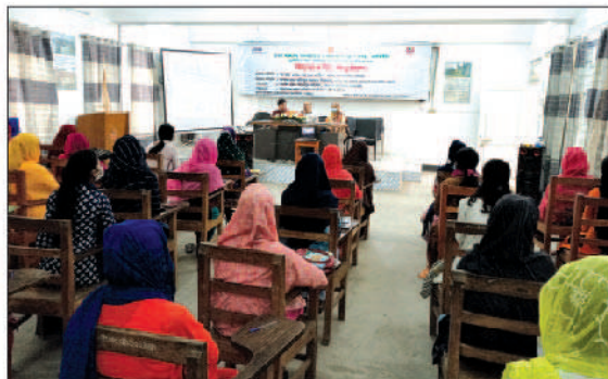
HILIP: A training class on Driving cum Auto mechanic for the beneficiaries organized by HILIP and implemented by Service Provider (BRTC Central Training Institute) at Gazipur.