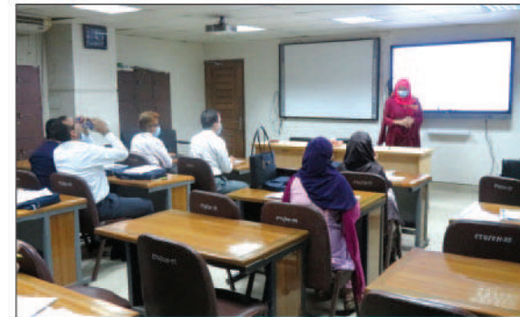
A participant is seen to conduct a dummy class on Address an Envelope" in the Training of Trainers' Course (TOT) held at CTU Dhaka.