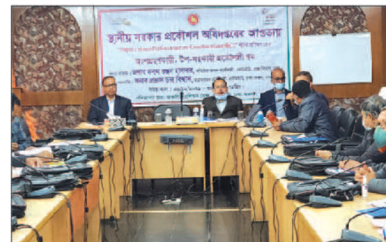
Training Course on Supervision of Infrastructure Construction (SIC) for the SAEs is conducted by the CRMIDP at RTC, Dhaka during 26-30/12/2021. SE(Dhaka Region), PD (CRMIDP) and other senior officers were present in the occasion.