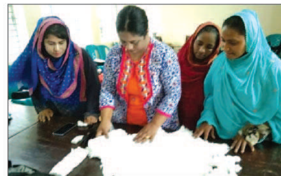
HILIP: Practical session of Sanitary Napkin Production & Marketing Training at Nabinagor, Brahmanbaria