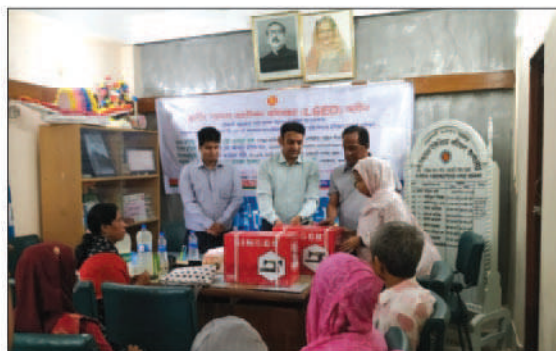
SSSWRDP: Participants are seen to receive the Sewing machine on completion of Training under SSSWRDP at Rangamati district