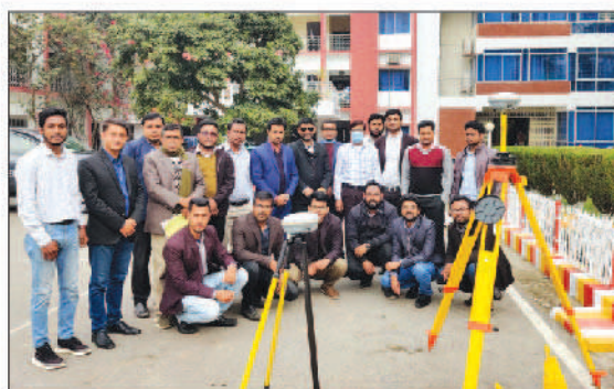
Training Group Pictures on Total Station Field Operation (RTK GPS Includes Data Transmission) at RTC, LGED, Rajshahi. (IPCP)