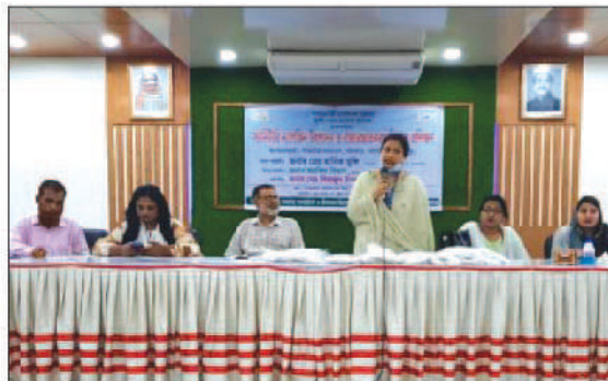
HILIP: Opening session of Sanitary Napkin Production & Marketing Training at Ashuganj, Brahmanbaria