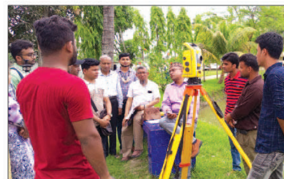
Field work on Total Station Field Operation (RTK GPS Includes Data Transmission), RTC, LGED, Jashore. (IPCP)