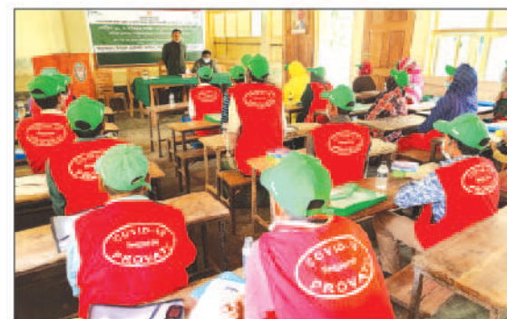
Capacity building training for LCS on construction technique and social aspect: COVID-19 additional programme held at Sadar, Kurigram.