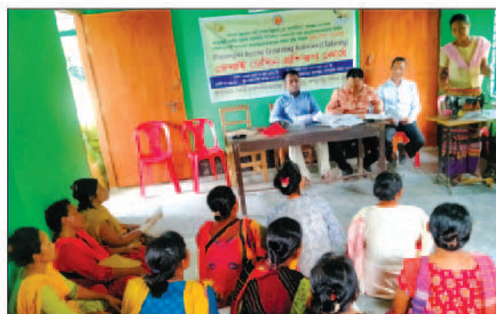
SSSWRDP: A training session on Income Generating Activities (Tailoring) (IGA) under the of SSSWRDP held at District: Khagrachari