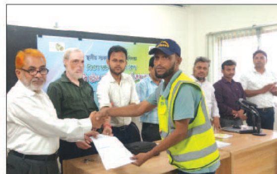
HILIP: Participants of Masonry training are seen to receive provisional certificate from the resource persons.