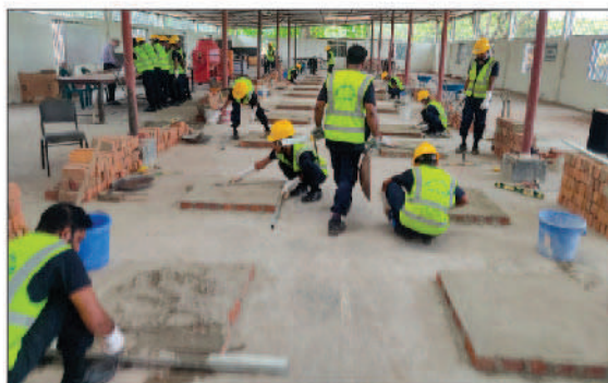
Participants of Masonry training are seen to practice brick work laying to develop skill among themselves at CSTC Gazipur.