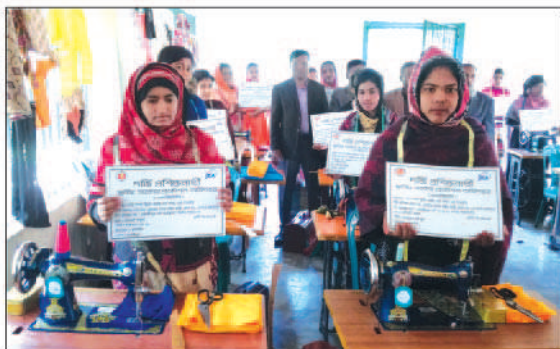
The participants are seen showing their certificates in the closing session of the "IGA Training on Tailoring/Embroidery Batik Block" at Char Laxmipur Subproject (SP-34114) Kalkini upazila, Madaripur district at 11-04-2022