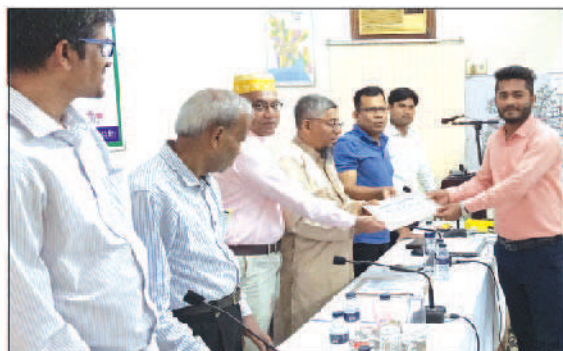
IPCP: Distribution of Training certificate on Total Station Field Operation (RTK GPS Includes Data Transmission), RTC, LGED, Jashore. (IPCP)