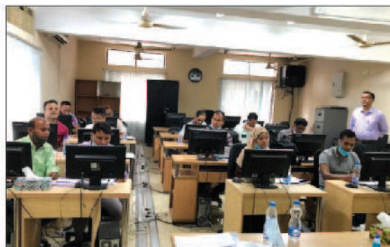
JMIIIP: A view of the practice session of Web Based Holding Tax Assessment Software held at RTC Mymensingh during 11-13 October, 2021