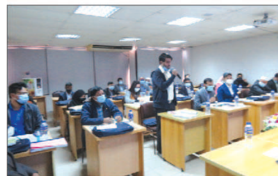
A participant is seen sharing with the trainers of the training course on Bangladesh National Building Code (BNBC) NBC Course at CTU HQ during 30/01-2/2/2022. At CTU, HQ