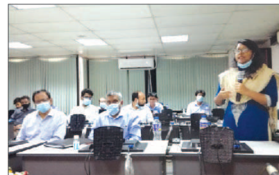
RCIP: A Female participant took part in the discussion of the Training on Road Safety held in CTU, LGED HQ