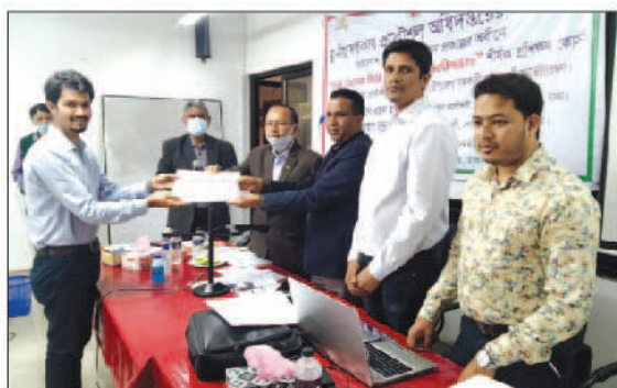
IPCP: Distribution of certificate on Total Station Data Processing Software, RTC, LGED, Dhaka. (IPCP)