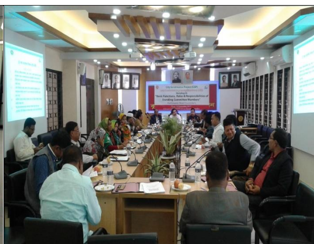
Standing Committee Members workshop held on 18/12/2017 at CoCC Conference room