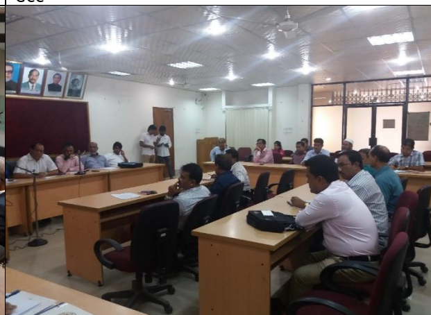
Members of Administrative Reform Committee participated the workshop on 5/10//2017 at GCC