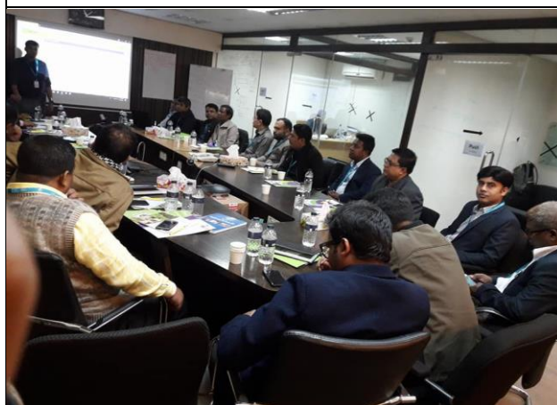
Workshop on online financial management software at Prime Minister Office held on 27th December 2017.