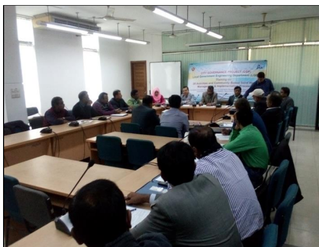
Training on 3R Activities and Community-Based Solid Waste Management & Implementation Process under CGP held on 27 Dec 2017 at LGED HQ