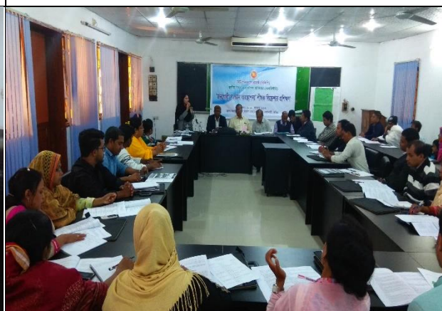
Refresher training for Community Organizer under PRAP held at Comilla BARD on 27-28 November 2017 for NCC & GCC