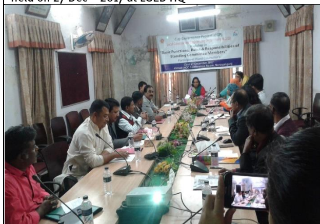
Workshop for the Standing Committee Members in held on 27/12/2017 at CNCC Conference room.