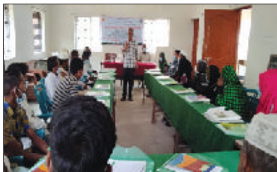
RARIP: Assistant Agriculture Officer, Beani Bazar, Sylhet is facilitating the training session on "Amar Bari Amar Khamar" held at BRDB Hall Room, Beani Bazar, Sylhet