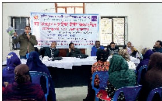
CTEIP: The resource person is conducting training class on poultry, cow & goat rearing for the poor and harardous women under IGA for Life & Livelihood programme at Daulatkhan Pourashava, Bhola.