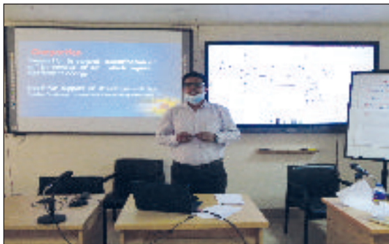
In a practice session, a participant is seen to demonstrate a lesson in the "Training of Trainers" (TOT) course" organized by the CTU at HQ, Dhaka