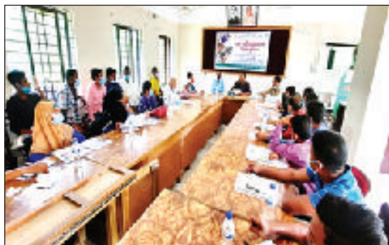
RARIP: Upazila Asst. Livestock Officer (UALO), Rajnagar, Moulvibazar is facilitating the training program on "Beef Fattening" held at Upazila Parishad Auditorium, Rajnagar