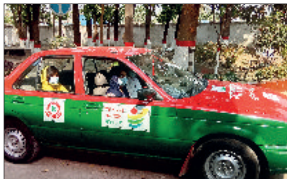
HILIP: Woman in training session on “Driving cum Auto-mechanic” organized by HILIP and implemented by BRTC, at BRTC Central Training Institute, Gazipur district.