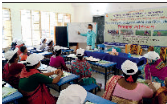
SSW: 20 Women members of Haturi Nadi WMCA of Boda upazila of Panchagarh district were given two days training in women farming skill development with adoption of new technology under SSWRDP (Phase-2).