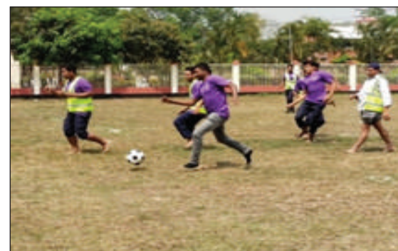
Participants of Masonry trade course are seen playing football as a part of training after academic time. This sort of extra curriculum put them to remove home sickness, gain strength resulting effective participation in the training programme.