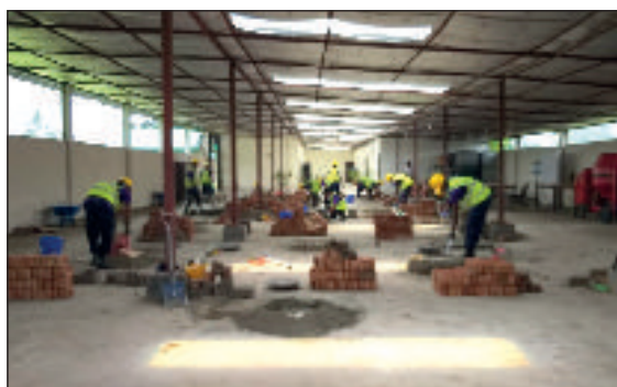
Participants of Masonry training are seen to construct brick wall as practice to develop skill among themselves at CSTC, Gazipur