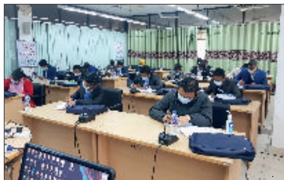
RCIP: Participants are attending exam so as to assess change in behavior/knowledge after attending training titled 'Climate Resilient Road design and Construction' held on 27th December 2020.