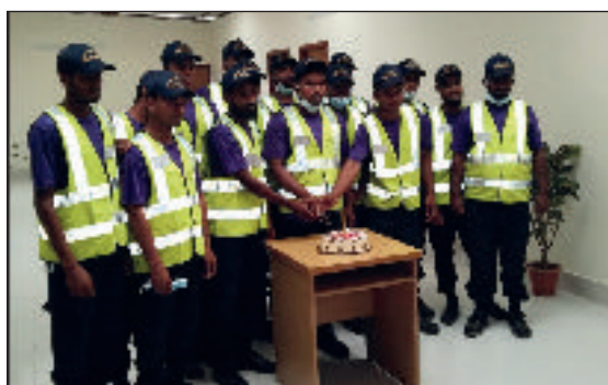
Participants of "Masonry" skill development training are seen celebrating the birthday of one of their colleague during training period. This is a symbol of unity, enjoyment, boost their moral, promote and gain strength during long training session of 45 days.