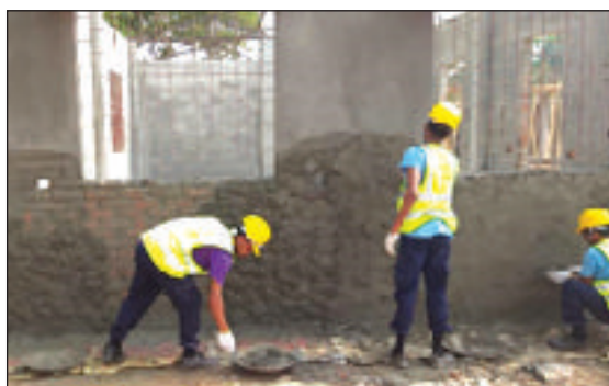
Hands-on training on plastering works as a part of masonry trade course for the labourers is in progress at CSTC, Gazipur.