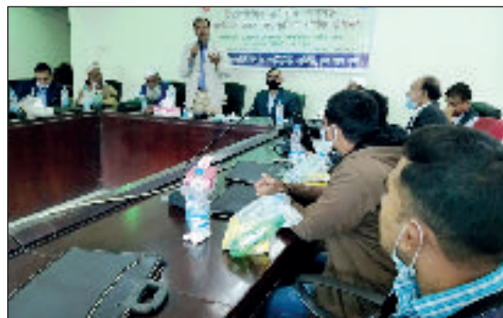
UMU: Mayor, Councillors, and member Secretary of Pourashava are seen attending a training course on "Roles & Responsibilities of Town Level Coordination Committee (TLCC)" organized by the MSU under MGSP at the Regional Municipal Support Unit (RMSU), Khulna, during 12-13/01/2021.