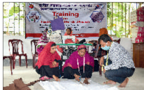
SSW: A view of 7-day long Hands-on training on Handicraft and Jute Diversified Product for the women members of Rothkhola Kamarkhali WMCA of Sharishabari, Jamalpur district is being conducted at sub project site under SSWRDP (2nd phase).