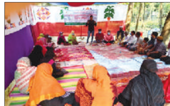
HFMLIP: A view of training session on ‘Fish Cultivation in the courtyard pond’ for the project beneficiaries under the project HFMLIP. HFMLIP: