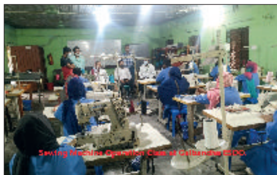
PROVATI: A view of the skill development training titled 'Sewing Machine Operation' is being conducted in Dewangonj Center, Jamalpur