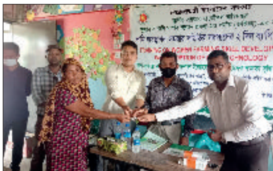
SSW: Training on Farming Skills development in agriculture and livestock with adaptation of new technology for women members of Hoor khal WMCA of Sadar upazila of Habiganj district was done under SSWRDP (Phase-2)