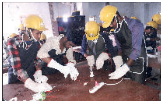
HILIP: A view of the “Electrical House wiring” Training organized by HILIP and implemented by Service Provider (TMSS) at Kishoreganj district.