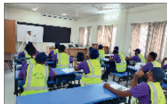
A view of a theoretical class of 45-days long Masonry Trade course is being conducted by a trainer in the CSTC training centre recently established in Gazipur.