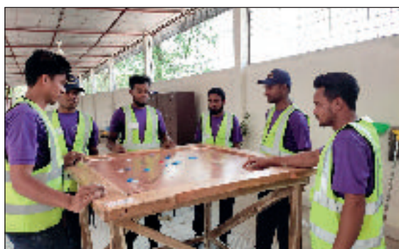
Participants of Masonry trade course are seen playing carrom board as a part of training after academic session. This sort of extra curriculum put them to remove home sickness, gain strength resulting effective participation in the training programme.