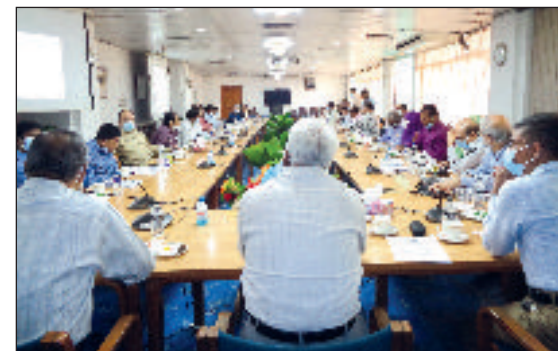
A view of the Training Progress Review meeting held in the Seminar Room, Level 4, LGED Building in 1st week of every month to review the progress, assist and resolve difficulties in implementation of course if any.