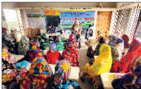
CRRIP: A view of the training class on “LCS Activities & Management” attended by the LCS members under CRRIP project at Patuakhali. A female trainer is seen to conduct the class.