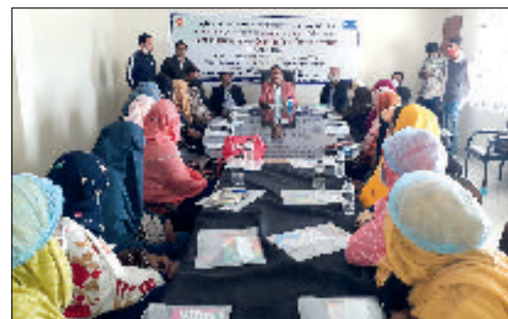
CTEIP: The resource persons are exchanging views with the poor and hazardous women in a training program titled ‘Fishery Cultivation’ under IGA for Life & Livelihood programme at Pourashava conference room at Amtoli, Borguna.