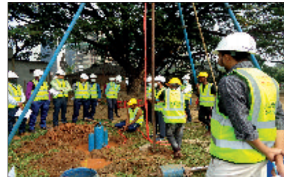
A demonstration session is going on as a part of training class on "Sub-Soil Investigation" for the Upazila Engineer/Upazila Assistant Engineer/Assistant Engineer held at CTU, Dhaka