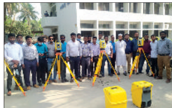
IPCP: The trainers and participants of the training course on “Total Station” held at RTC, Khulna are seen in a group.