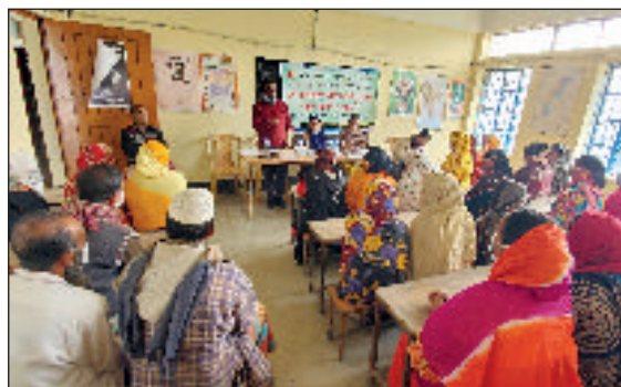
CRRIP: Trainers are seen to conduct the training on “LCS Scheme Implementation” for the LCS members at Galachipa, Patuakhali.