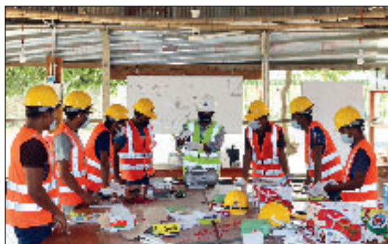
PROVATI: Hands-on training on “Electrical Works” at Kurigram district held 25 May 2021 at Kurigram organized by Provati3