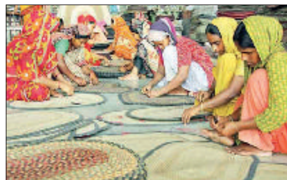
SSW Practice session followed by 2-day long training on income generating activities for the women members of Char Madangopal Rayer Chhara WMCA of Madarganj Upazila of Jamalpur district is in progress.