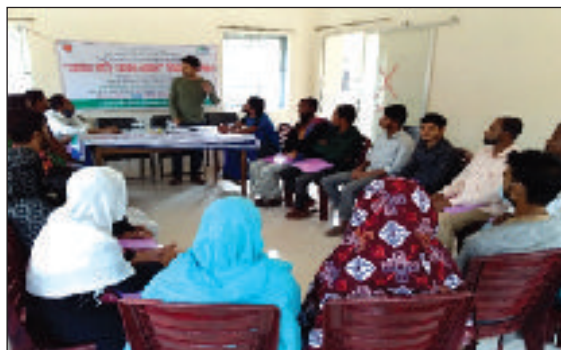
RARIP: Upazila Agriculture Extension Officer, Dharmapasha, Sunamganj is facilitating the training session on "Amar Bari Amar Khamar" held at BRDB Hall Room, Dharmapasha