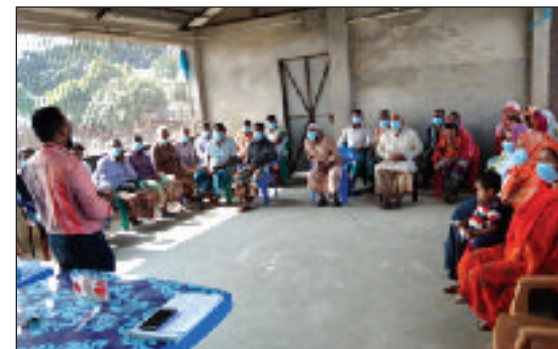
HFMLIP: A view of the training course on 'Beel Management' for members of the Beel Management Committee is being conducted by the project HFMLIP.