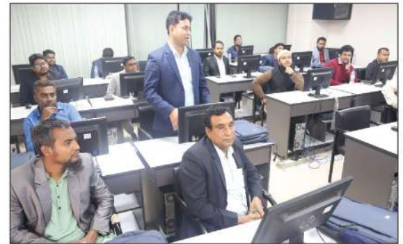
A View of Classroom session of training course on "Contract Management & e-GP held at LGED HQ" during 17-21 November, 2024. A participant is seen sharing views with resource person.