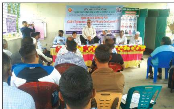
Project Director, SSW-JICA is seen delivering speech in the opening session of the training on Agri-business & Marketing Plan (O&M of Agribusiness Center for Flagship Development SP) for Raijal Helalpur WMCA at Jagannathpur Upazila, Sunamganj Upazila.