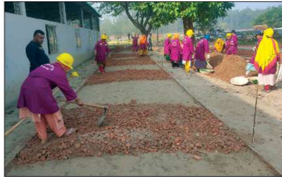
Female workers are seen participating (Base course) construction practice session on 21 days long Road Construction training under Provati project.