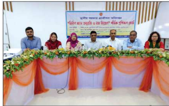
Resource persons and Trainers are seen in the training course of Construction Supervision and Quality Control course held at RTC, Rangpur