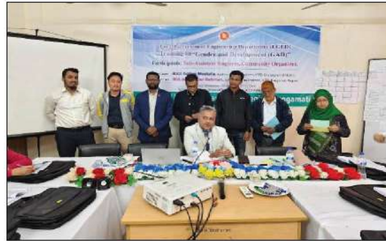
Before Group work presentation guidance are given by the resource persons in the Gender and Development course held at Rangamati