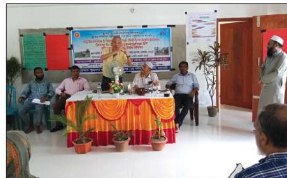
Training on Agri-business & Marketing Plan (O&M of Agri-business Center for Flagship Development SP) for Kumrirani WMCA at Kalukhali Upazila, Rajbari district.