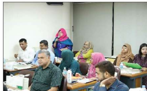
A participant of the training on "TOT on Adjustment of Standards, Procedures, and Guidelines Considering Climate Resilience (Rural, Urban and Water), shares her feedback during the closing session held on 31 October 2024