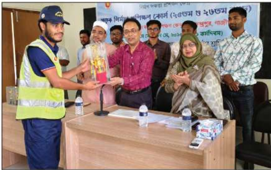
A participant is seen receiving crest for the best performance in the Road Construction training for unskilled labours in CSTC, Gazipur.