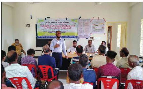
A view of training course on O&M (Before/After Hand-over) for WMCA and Joint Walk-through for Panail WMCA held at Alphadanga Upazila, Faridpur district.