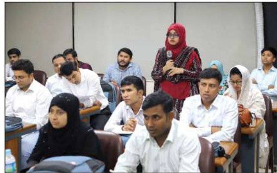
A female Account Assistant is seen sharing views with the resource persons in the training class on Financial Management including Financial rules, Accounts and Audit.