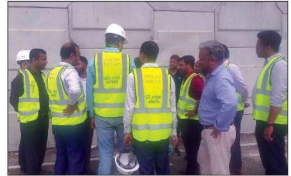
Participants of the training course on PSC, Arch bridge and MSE Wall construction are shown the recently constructed MSE wall and its construction procedures.