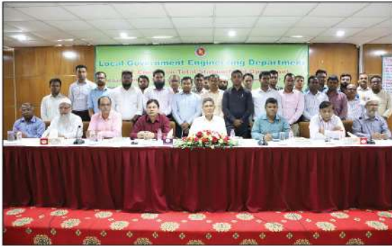
A group photo of the participants (Surveyors) along with Chief Engineer, Addl. Chief Engineer (HRD & QC), Addl. Chief Engineer & PD (SupRB), Superintending Engineer (HRD) and senior Engineers of LGED in the Opening Session of TOT on Total Station at level 12, RDEC Building.