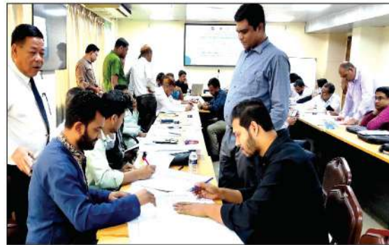
Group Works are being held on Non-Tax Collection in a training session held at Chattogram RTC, LGED on 23-24 February 2025