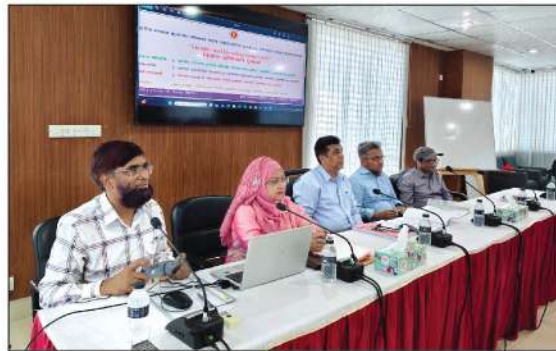
Senior Engineers of Rajshahi Region and CTU Hq are present in the Opening session of Gender and Development Course held at RTC Rajshahi.