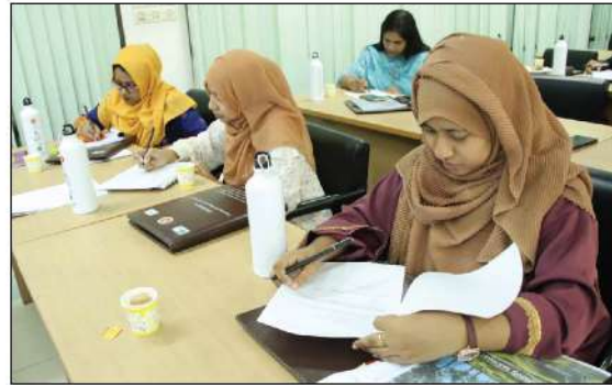
Participants of the "Operation and Management of CreLIC" training are seen taking part in a knowledge assessment at LGED HQ on 23 October 2024.