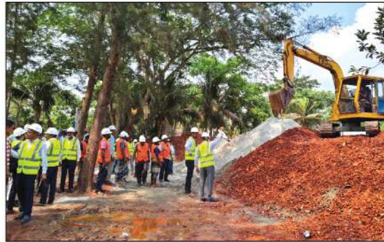
An OJT Training on Wet Mix Macadam (WMM) held at Borguna where participants are observing separate mixing of Khoa & Sand and Water sprayed to get OMC of the mix.