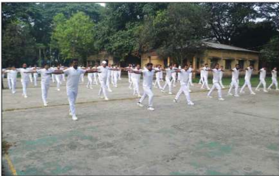
As a part of training course, the participants of the Foundation Course are seen participated in the physical exercise in the morning at ESCB premises.