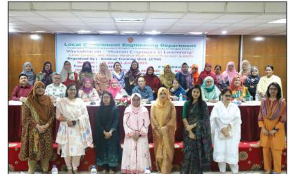
A view of the LGED women engineers participated in the workshop on 'Women Engineers in Leadership' organized by CTU and funded by IRDPK held on 23 June, 2025. SE(IWRM), SE(HRD), PD (IRDPK), XENs (Trg) also seen among the participants.