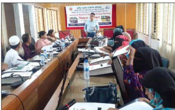
A trainer is seen conducting Training on Deshi Chick, Duck & Goat Rearing for Alipur Khal WMCA at Sonargaon Upazila, Narayanganj.