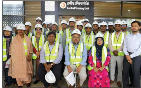
A group photo of the participants and Resource persons of the training course on PSC, Arch bridge and MSE Wall construction before Field visit