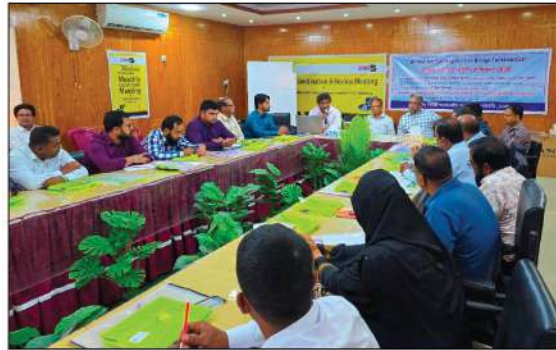
A discussion session on spun pile technology is held in the Netrokona district after field visit.