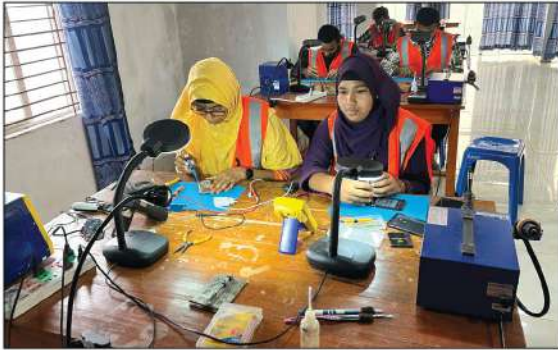
A view of the Vocational Training on Mobile Phone servicing conducted by ESDO-Rangpur under PROVATi3 Project