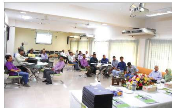
A view of the participants (Upazila Engineer, Upazila Assistant Engineer, Accountant of LGED) attending External Audit Management course at FIMA, Mirpur, Dhaka during 24-28 Nov. 2024