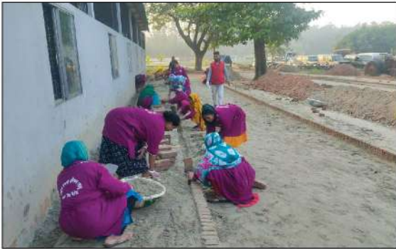
Female workers are seen participating (End Edge construction) in the practice session of 21 days long Road Construction training under Provati project.