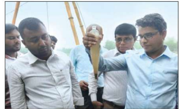
Participants are seen practicing OJT on Sand contents test in the bore hole at Rangpur.