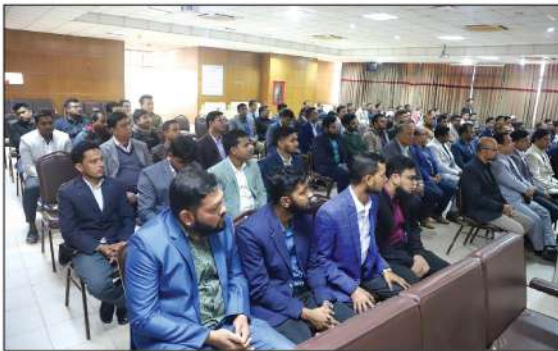
A view of opening session at level 12. Opening session organized for four courses such as Quality Control test and Related Equipment of CTCRP (Sr.AE, UE, UAE), GoB funded Bridge Construction and Quality Management, Financial Management including Financial Rules, Accounts and Audit. and e-GP funded by GSID-2.