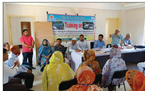
A view of training on Agri-business & Marketing Plan (O&M of Agri-business Center for Flagship Development SP) for Moharashi WMCA at Jhenaigati Upazila, Sherpur district.