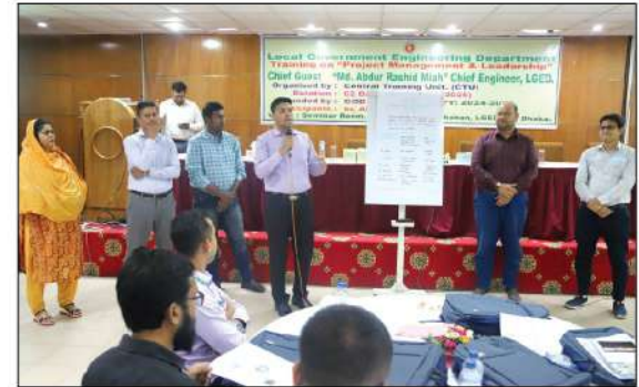
As a part of training on Project Management and Leadership, a group presentation is seen going on where the presenter is leading the presentation on Management Issue.