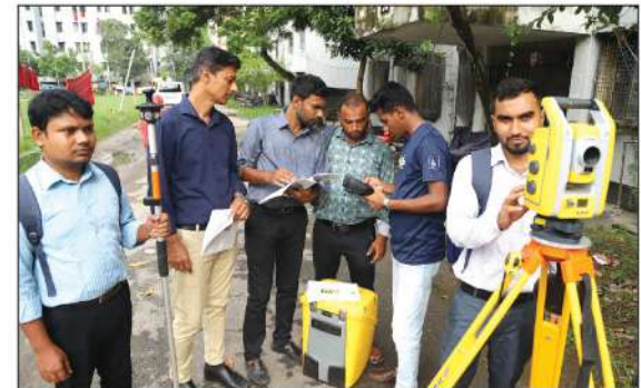
Under the guidance of the Trainer, the participants are practicing the operation of Total Station apparatus as a part of practice session in the TOT course on Total Station held at RDEC during 22-26 September, 2024