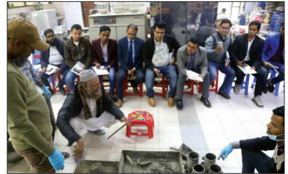
Assistant Engineer of Quality Control Unit is demonstrating test to the participants in the Central Laboratory.