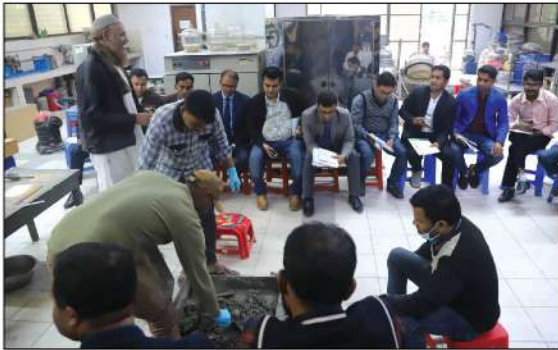
A demonstration session is being conducted on Quality Control (QC) Test and related equipment at Central Laboratory at HQ, Dhaka by CTCRP