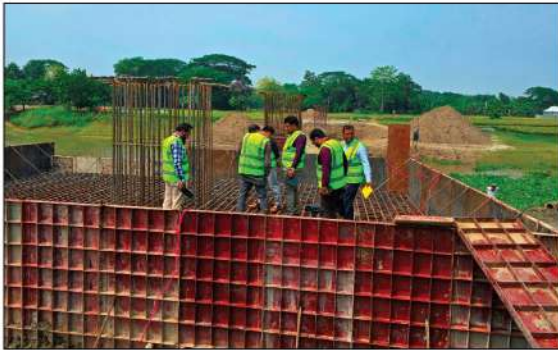
A view of the spun pile technology introduced in LGED, Netrokona district