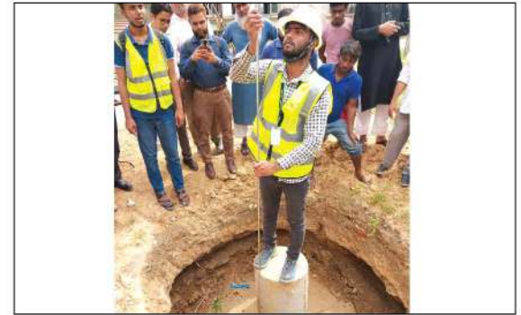
A view of the Field activity of training class on Soil Investigation & Design (Part 2) where engineers are seen taking part in the test operation during 27-30 April 2025. The course is funded by IRDPK