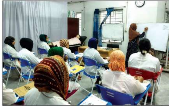
An Vocational Training on General Caregiving (level-2) only for Women participants is being conducted by ESDO under PROVATi3 Project