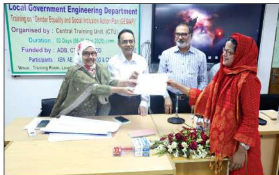
A participant of Gender Equity and Social Inclusion Action Plan is seen taking certificate from Superintending Engineer, IWRM (O&M). Additional Chief Engineer (HRD QC & Env.) and Superintending Engineers (HRD) are also present in the occasion.