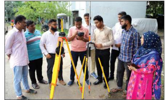
Under the guidance of the Trainer, the participants are practicing the operation of Total Station apparatus as a part of practice session in the TOT course on Total Station held at RDEC