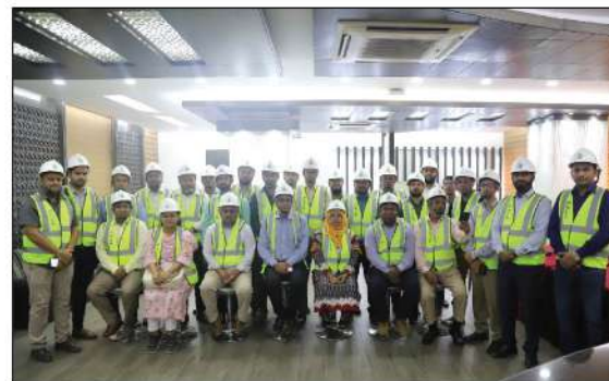
A group photo of the participants along with the Resource persons before going to the construction site of MSE wall PSC Girder Bridge & Arch Bridge construction held during 6-10 October-2024 under CIBRR-2.