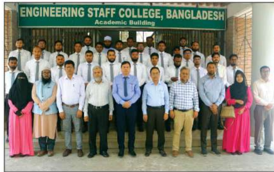
Participants of the Foundation course and senior management of LGED and Academic members of ESCB are in the Group picture.