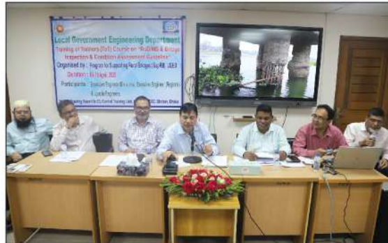
TOT Training course on RUBIM & Bridge Inspection & Condition Assessment Guidelines are being held at CTU, HQ. Chief Engineer, LGED, Addl. CE, SE (HRD) SE (SupRB) and other engineers are present in the opening's session