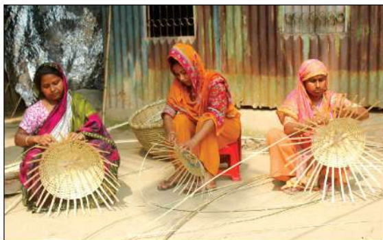
Self-Reliant women of Katakhal Khal WMCA are seen in work (making bamboo case) after receiving IGA training held at Gheor Upazila, Manikganj district