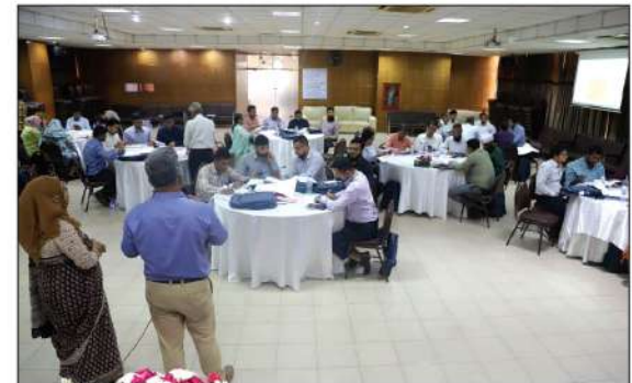
A view of the group work, supervised by the trainers, participants are completing the task and getting preparation for presentation.