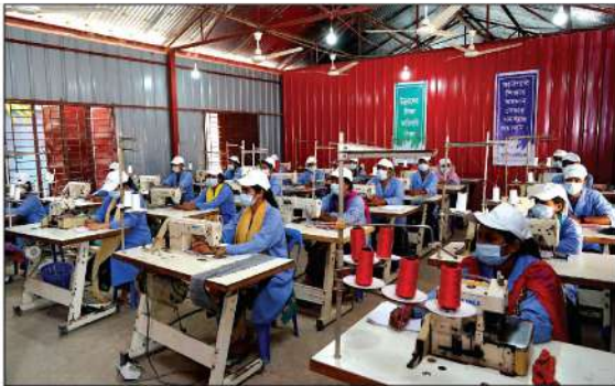
Vocational Skill development training on Sewing machine operation at Jamalpur by ESDO under PROVATi3 project.